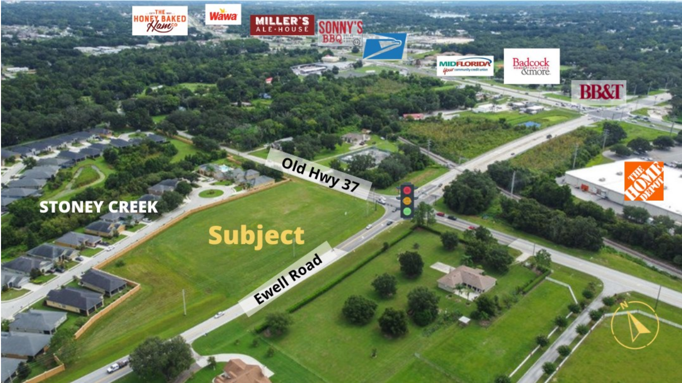
LOOKING NORTH OF PROPERTY