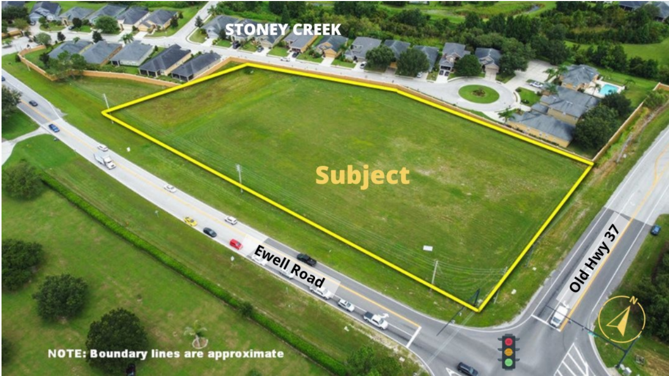
Subject Property—3.55 Ac. Retail or Office Development Site