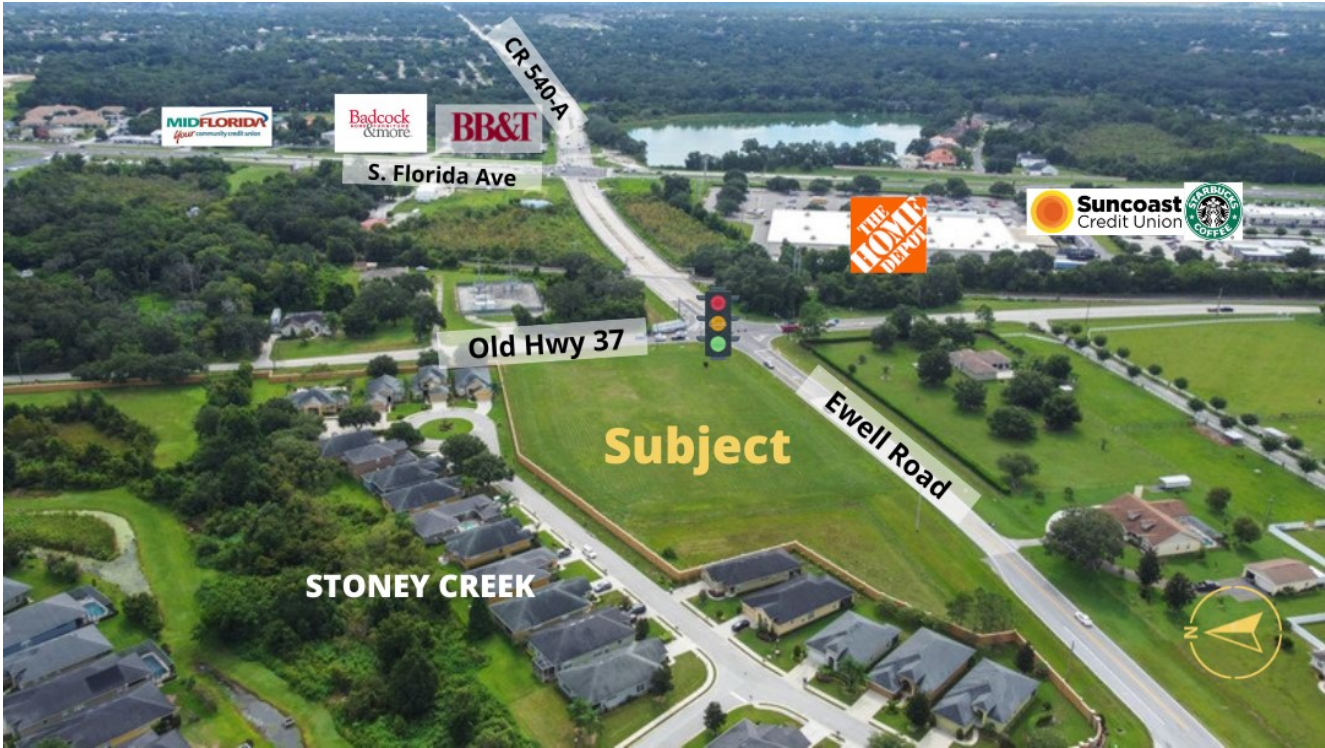
Looking East from Property