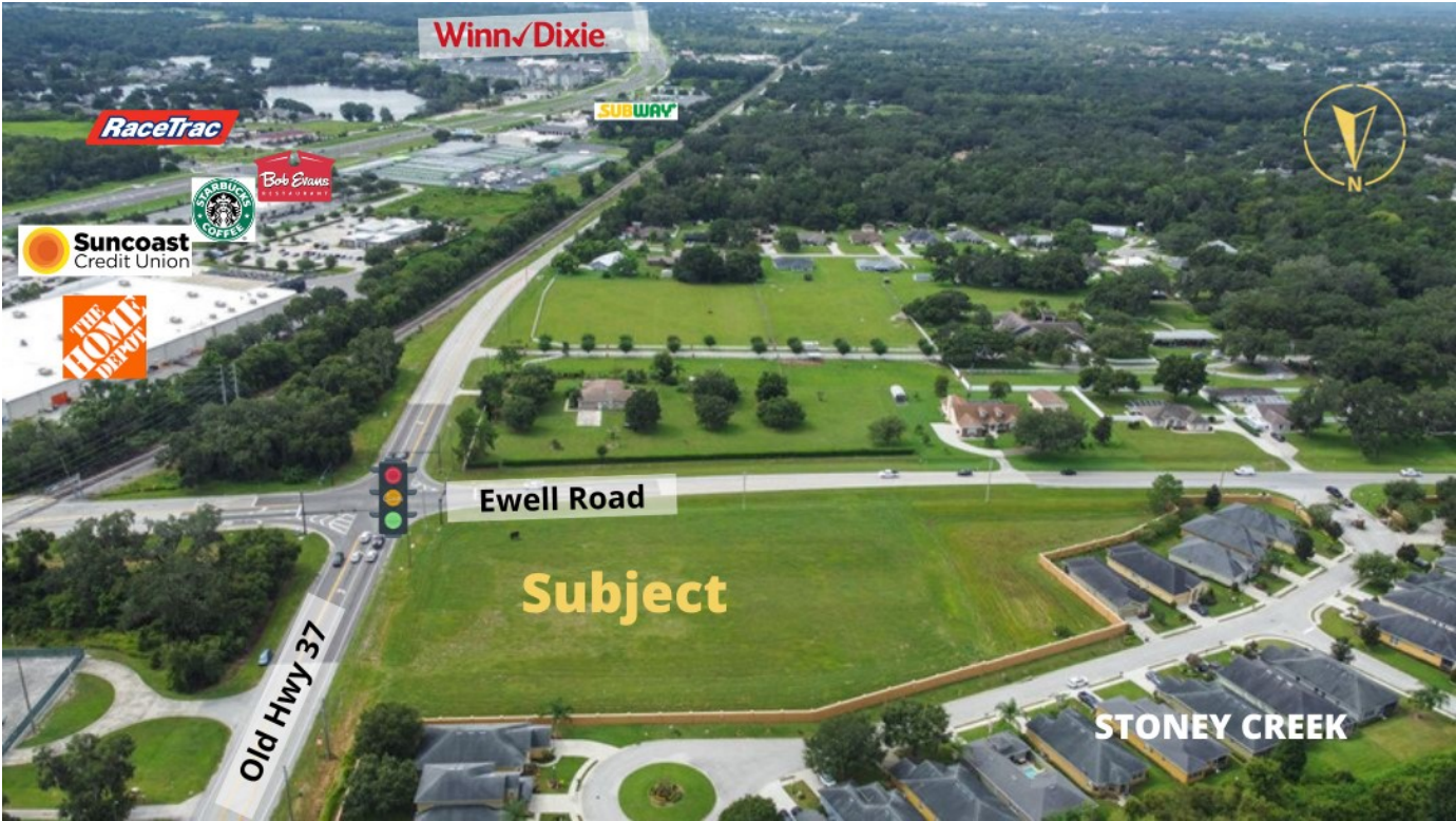
LOOKING SOUTH OF PROPERTY