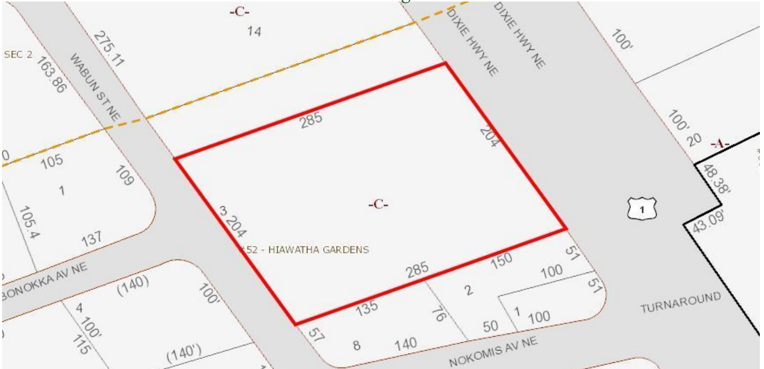
Plat & Zoning Aerial