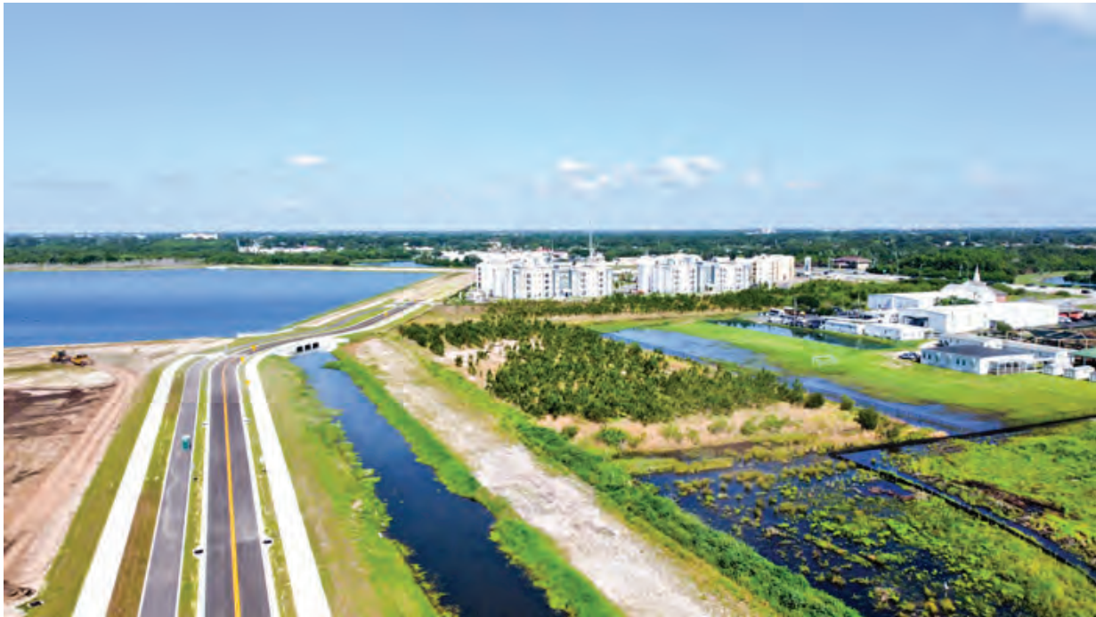
NeoCity Ethos Park Drive

The new roadway, which includes a 1,600-foot spur called Ethos Park Drive, features two lanes of traffic with a divided and landscaped median, a grade-separated 12-foot Veloway specifically dedicated to bicyclists and rollerbladers, and two 10-foot wide sidewalks on each side of the road. In addition to the state economic development grant, local funds were used to complete construction of the $11.3 million project, which broke ground about two years ago.