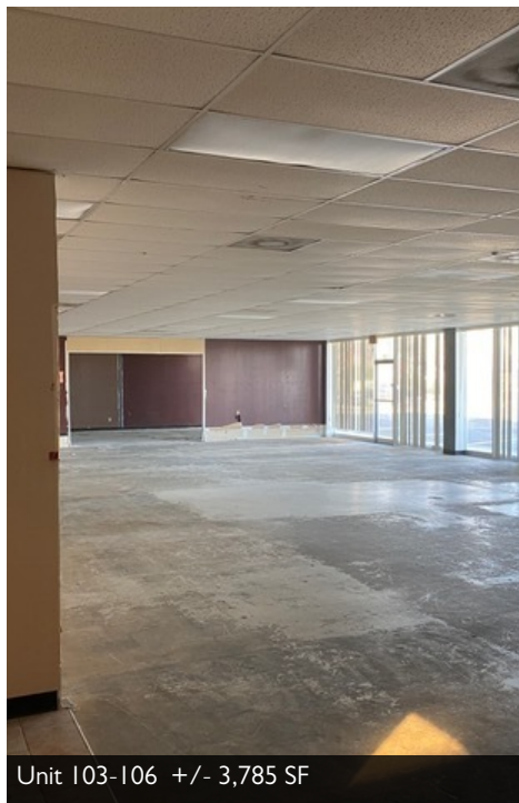
Unit 103-106 +/- 3,785 SF