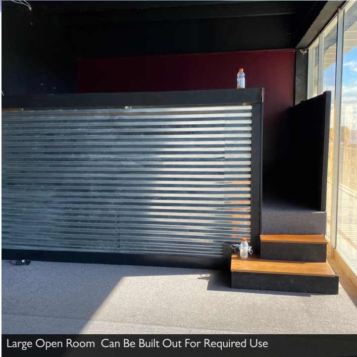
Large Open Room Can Be Built Out For Required Use

Buena Vista Building • 3910 S Washington Ave Titusville, FL 32780