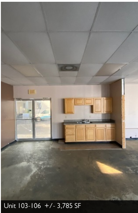
Unit 103-106 +/- 3,785 SF