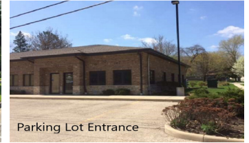
Parking Lot Entrance