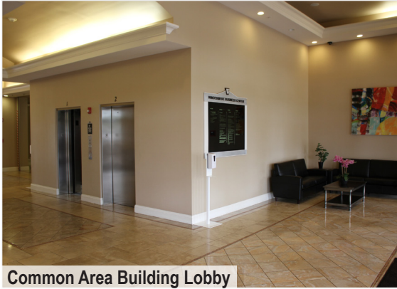
Common Area Building Lobby

6735 Conroy Road, Unit 403, Orlando, FL 32835