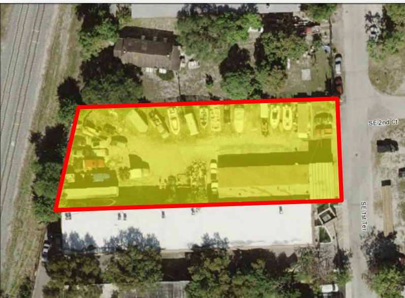
Direct Aerial View