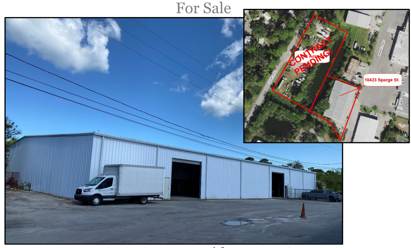
10423 Sparge Street, Port Richey, FL 34668