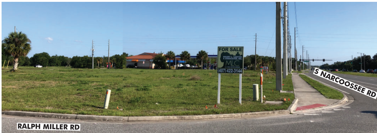
RALPH MILLER RD