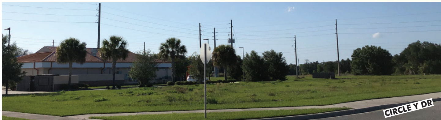
CIRCLE Y DR