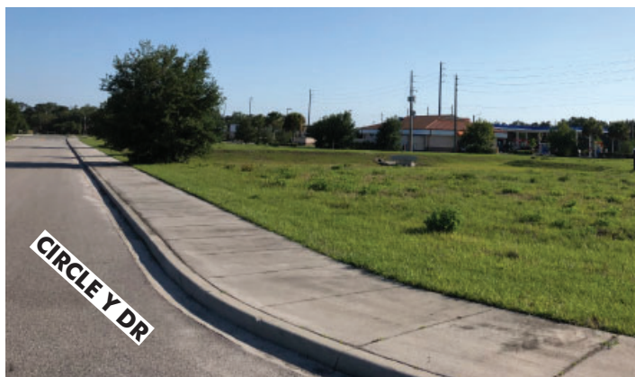
CIRCLE Y DR