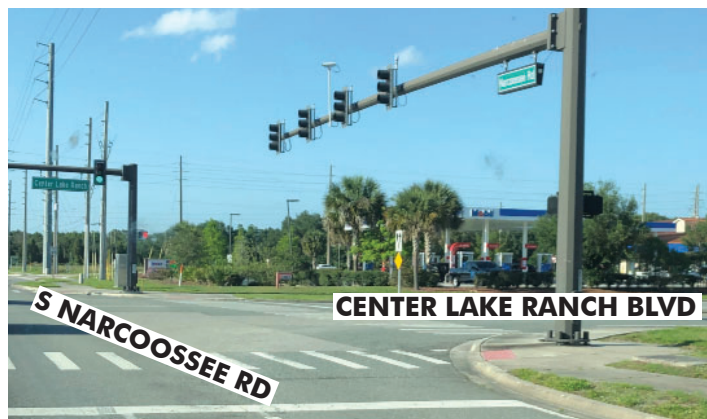
CENTER LAKE RANCH BLVD