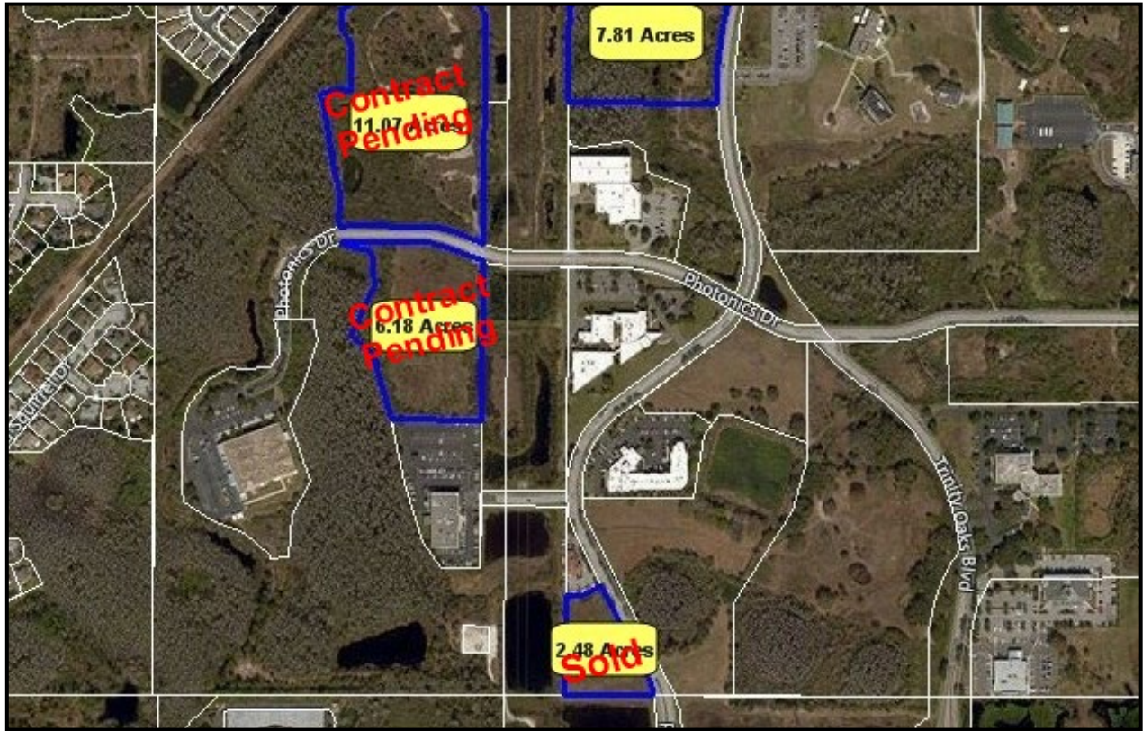
Trinity Commerce Park, Trinity Florida