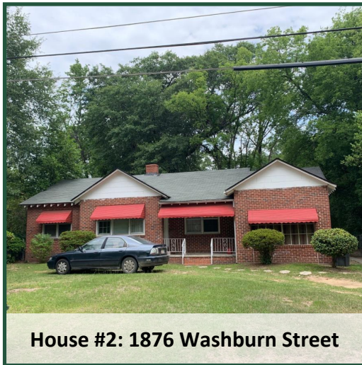
House #2: 1876 Washburn Street