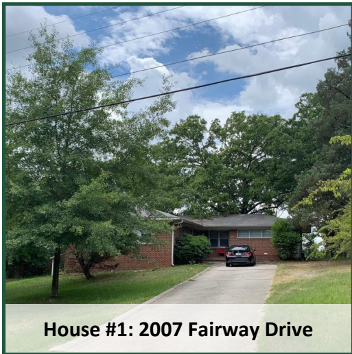
House #1: 2007 Fairway Drive