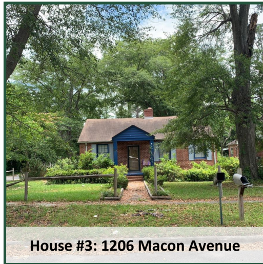
House #3: 1206 Macon Avenue