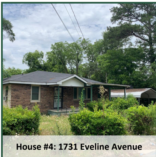
House #4: 1731 Eveline Avenue