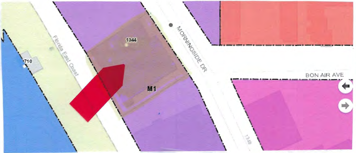
City of Melbourne: Zoning & Future Land Use Viewer