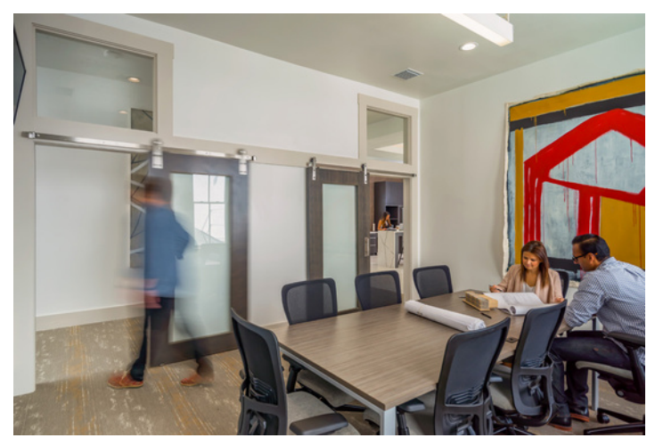
12 PERSON CONFERENCE ROOM