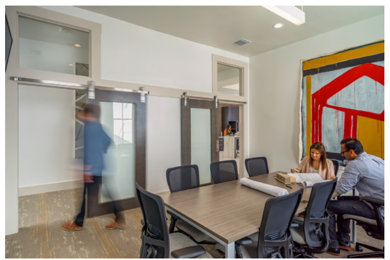
12 PERSON CONFERENCE ROOM