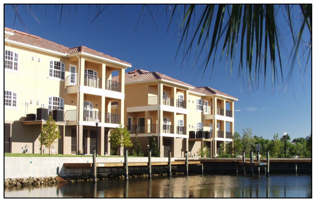
Sea Forest Drive & Green Key Road, New Port Richey, FL 34652