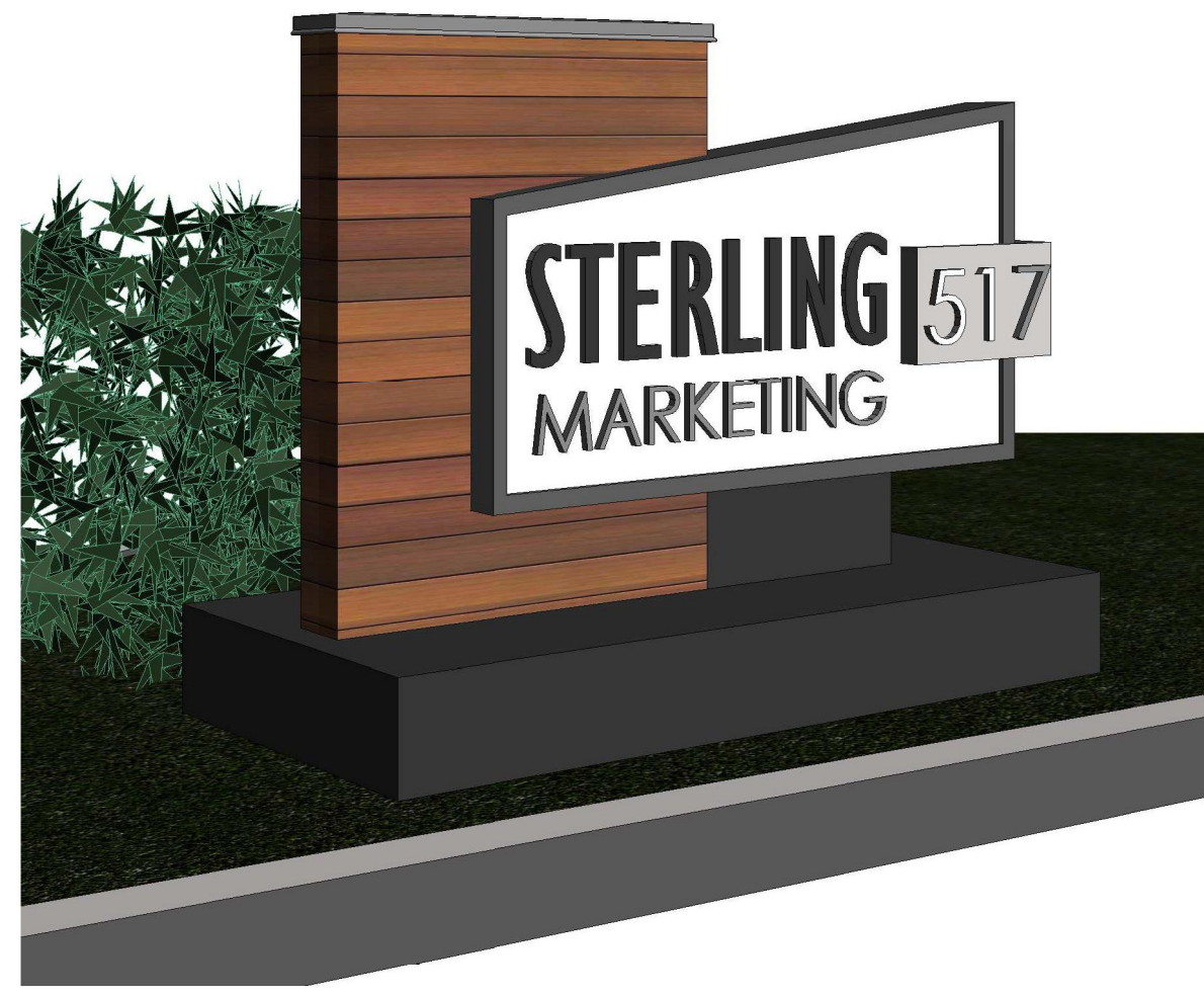
2 MONUMENT SIGN - PERSPECTIVE SCALE: NOT TO SCALE