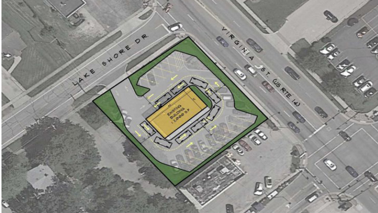
CONCEPT SITE PLAN DRIVE-THRU Q.S.R. 487 W. VIRGINIA STREET CRYSTAL LAKE, IL HAEGER ENGINEERING CONSULTING ENGINEERS ARCHITECTS INTERIORS 1000 W. WASHINGTON ST. SUITE 200 CHICAGO, IL 60606-3000 TEL: 773.399.8800 FAX: 773.399.8801 WWW.HAEGERENGINEERING.COM