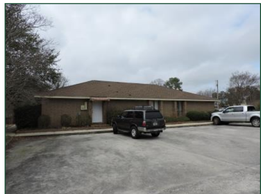
Parking & Side Entrance