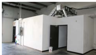
HVAC in Office