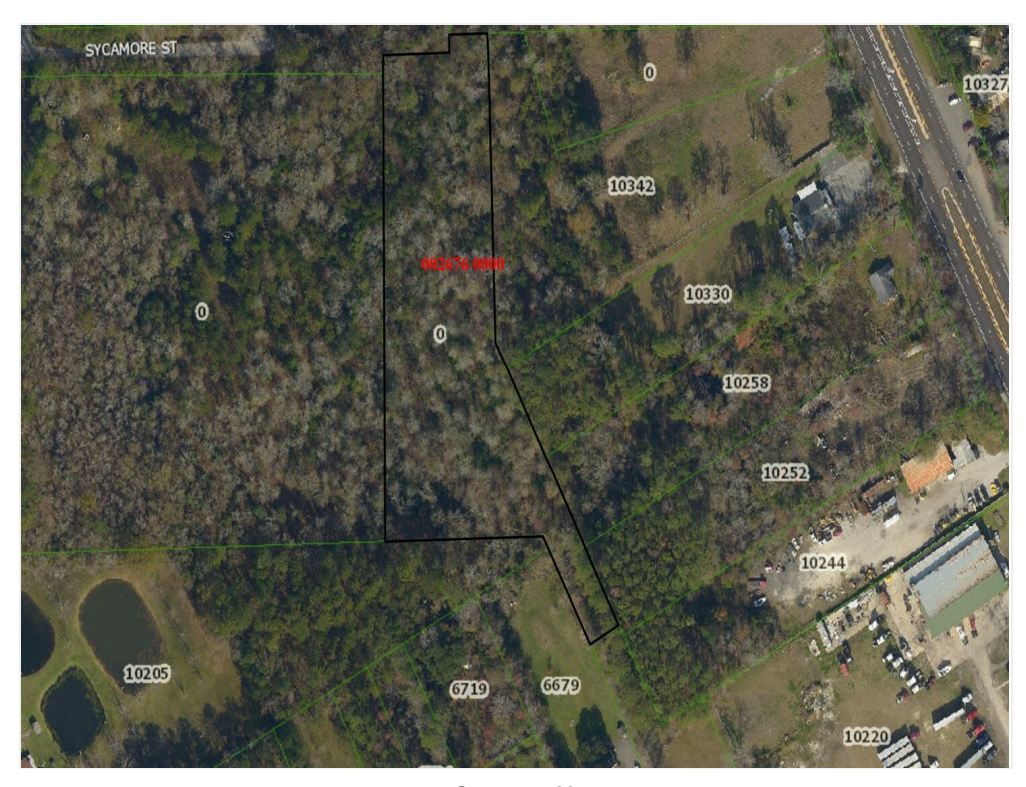
0 Sycamore Map