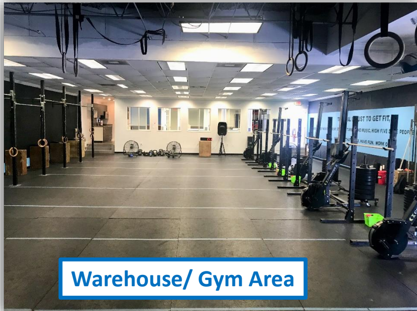
Warehouse/ Gym Area

Disclaimer: This offering subject to errors, omissions, prior sale or withdrawal without notice.