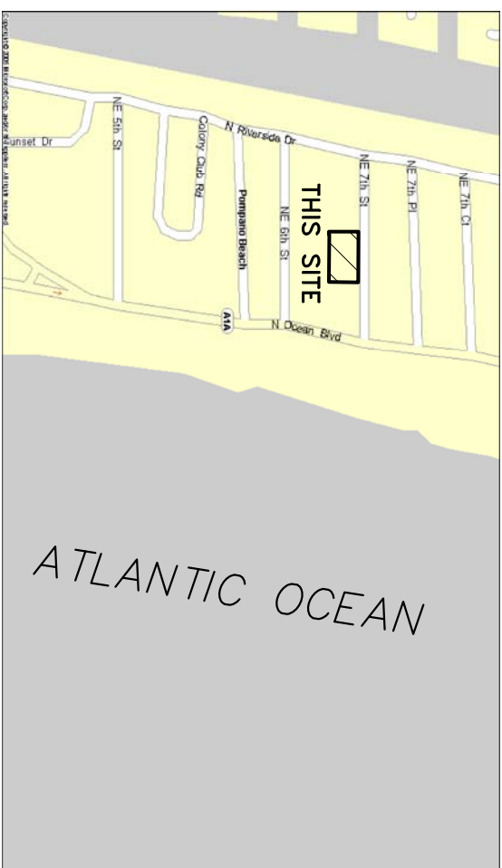
LOCATION MAP (NTS)

ITEM # 7 - RESTRICTIONS, COVENANTS, CONDITIONS PER O.R.B. 47974, PG. 368, B.C.R. AND O.R.B. 47974, PG. 673, B.R.C. (SUBJECT TO PROPERTY), AS MAY BE SUBSEQUENTLY AMENDED. (AFFECTS / NOT PLOTTABLE)