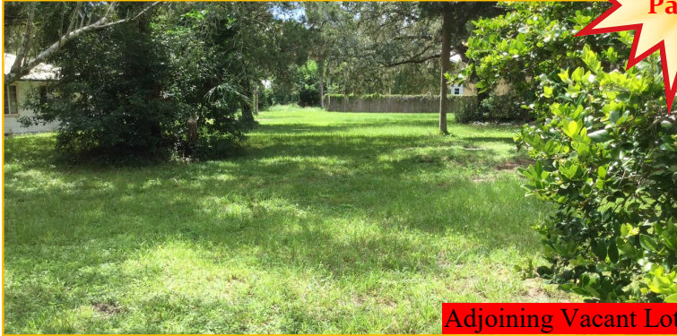
Adjoining Vacant Lot