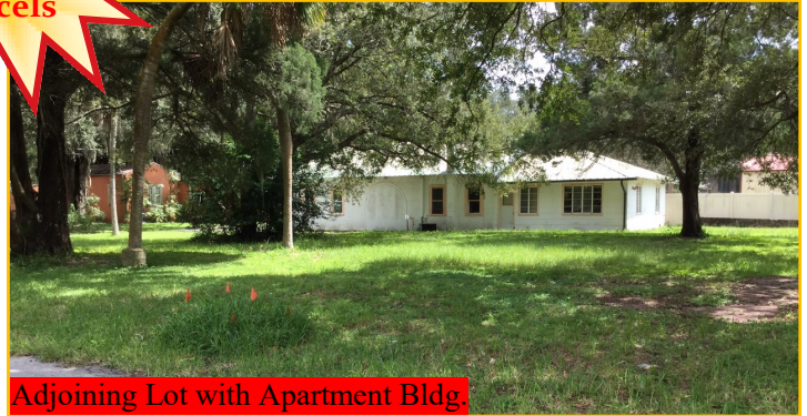
Adjoining Lot with Apartment Bldg.