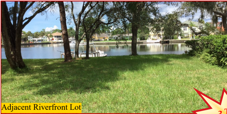
Adjacent Riverfront Lot