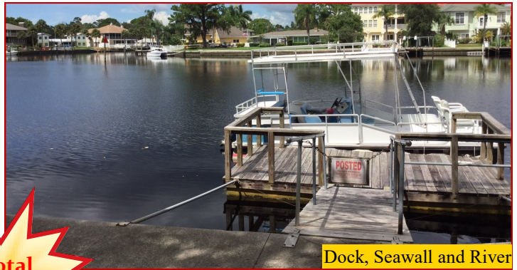
Dock, Seawall and River