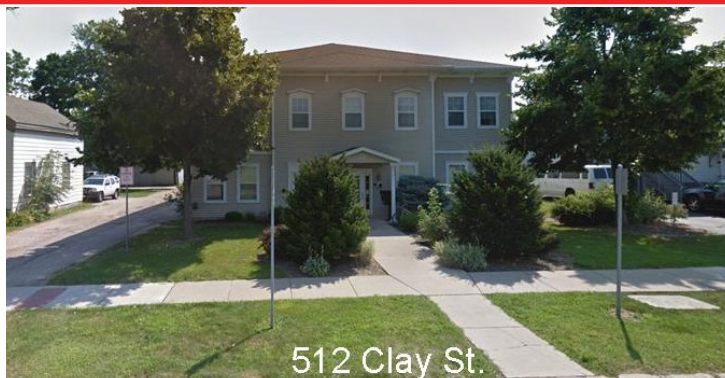
512 Clay St.

INVESTMENT 19,861 SF FULLY LEASED OFFICE BUILDING