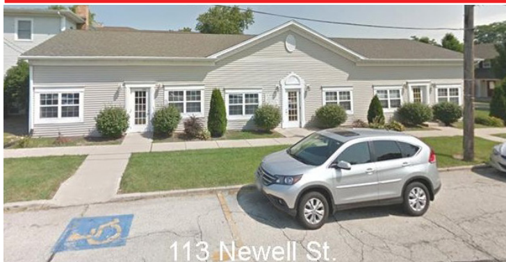
113 Newell St.