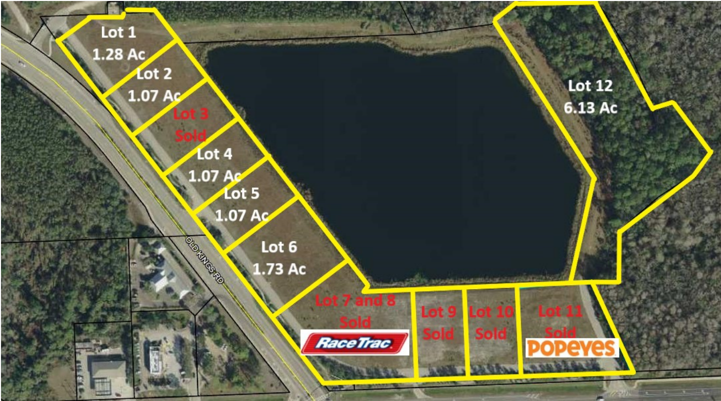
Kings Pointe Site Map

For Sale Commercial Sites Palm Coast, Florida 32137