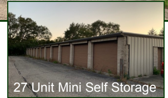
27 Unit Mini Self Storage