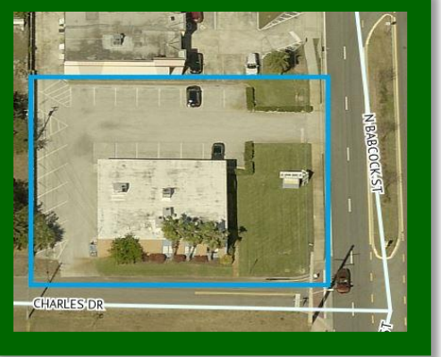
Medical/Office Space For Lease

Lease Price $14.00 Sq Ft +CAM $2.45 sq ft