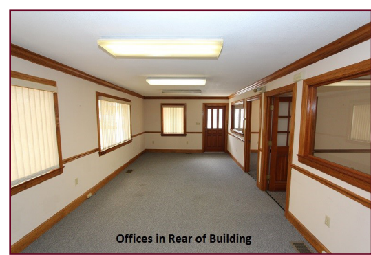
Offices in Rear of Building