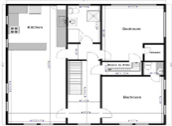
Upper Story (formerly used as an apartment) 1,928 SF±