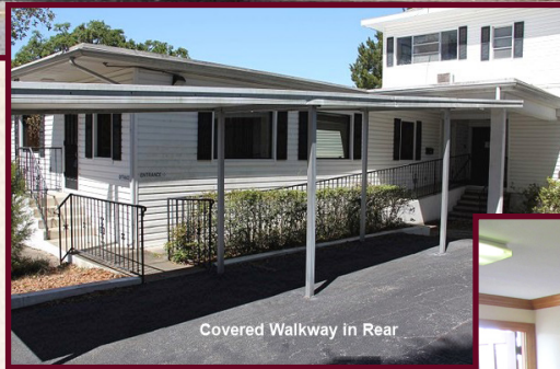
Covered Walkway in Rear