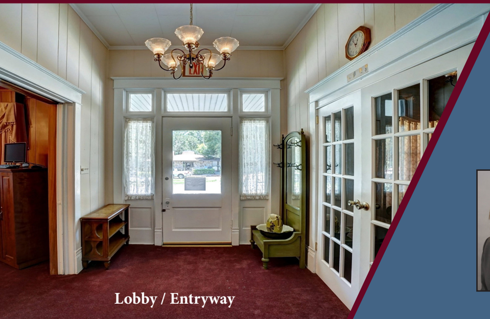
Lobby / Entryway