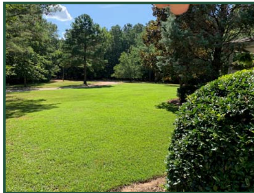
114± Acres with Pond