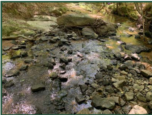
144± Acres with Pond