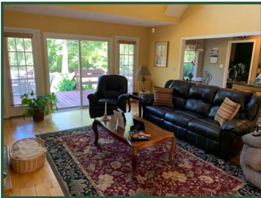
Interior of House