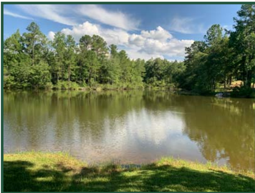
3± Acre Pond