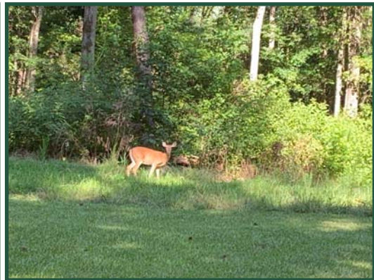
114± Acres with Pond

Trip Wilhoit, CCIM, ALC 478-746-9421 (O) 478-960-4080 (C) trip@fickling.com