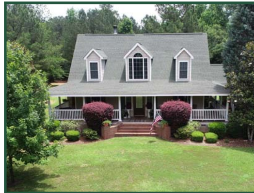
3 BR/2½ BA House