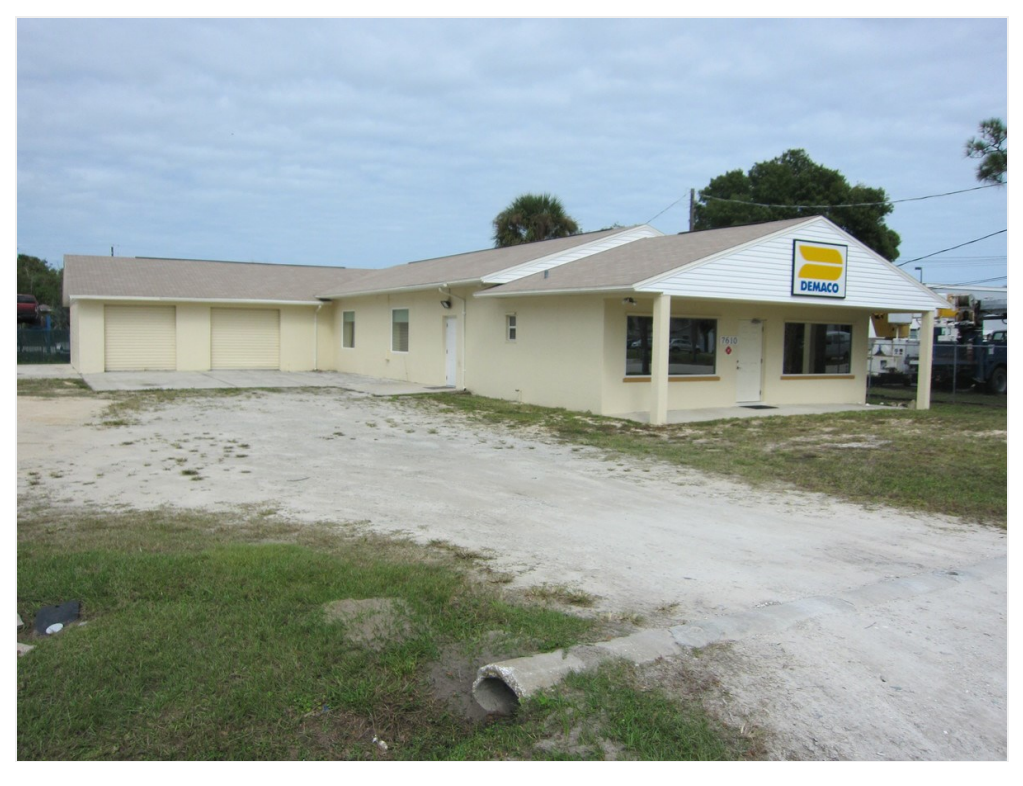
7610 Coral Drive W Melbourne FL 32904