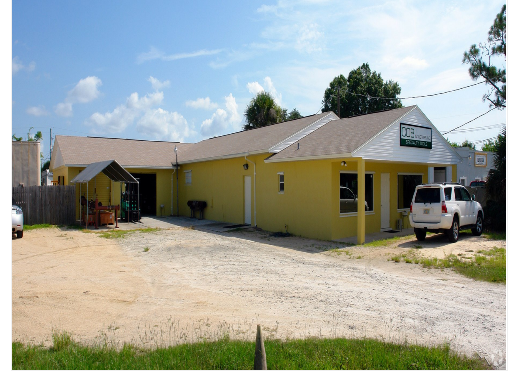
7610 Coral Drive W Melbourne FL 32904