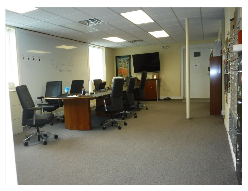
7610 Coral Drive W Melbourne FL 32904