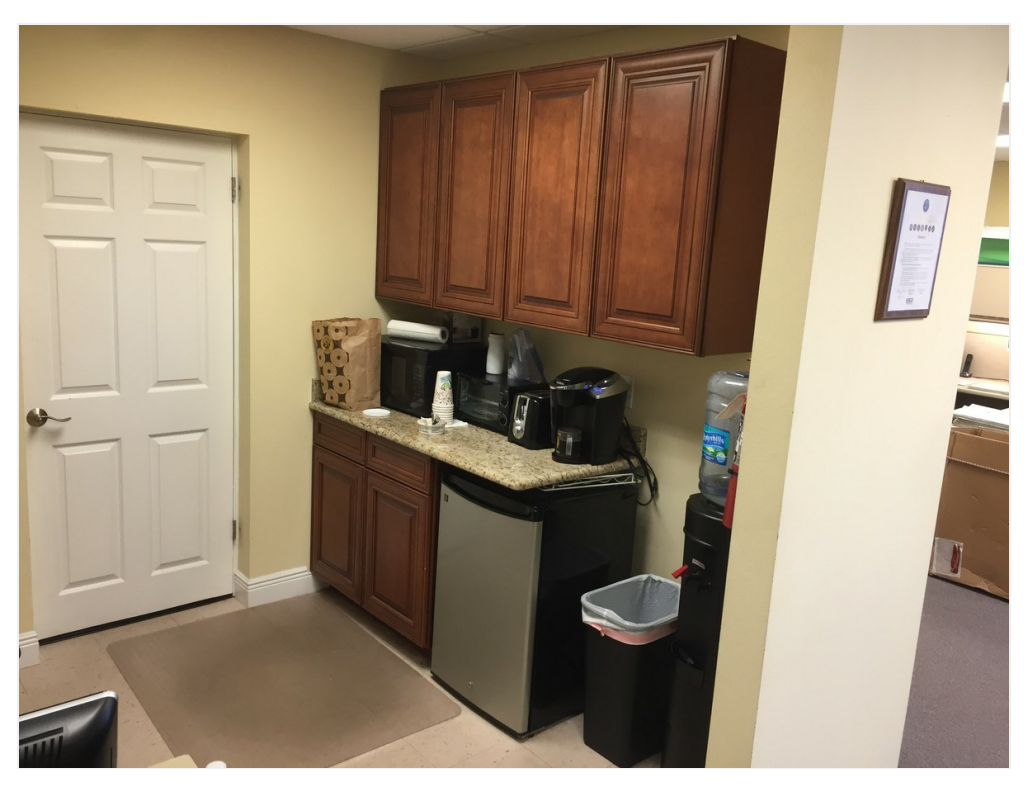
7610 Coral Drive W Melbourne FL 32904