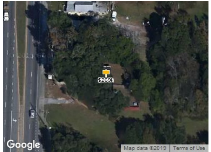
Legend: Subject Property