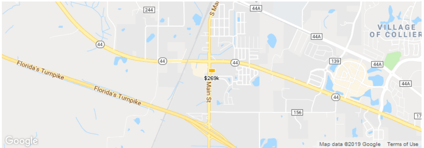
Legend: Subject Property