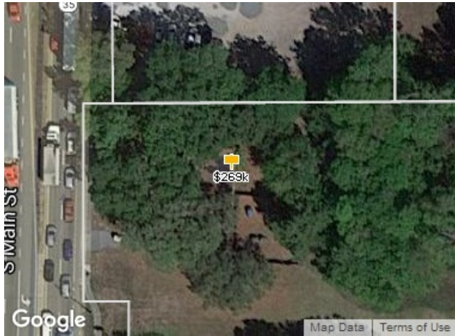
Legend: Subject Property