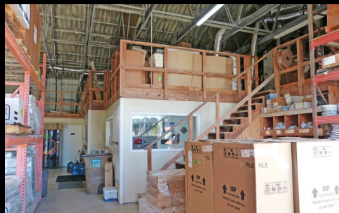
1,800sf Mezzanine Storage