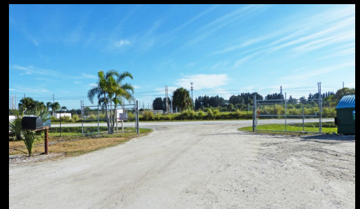
Gated Entrance, 6ft Fence