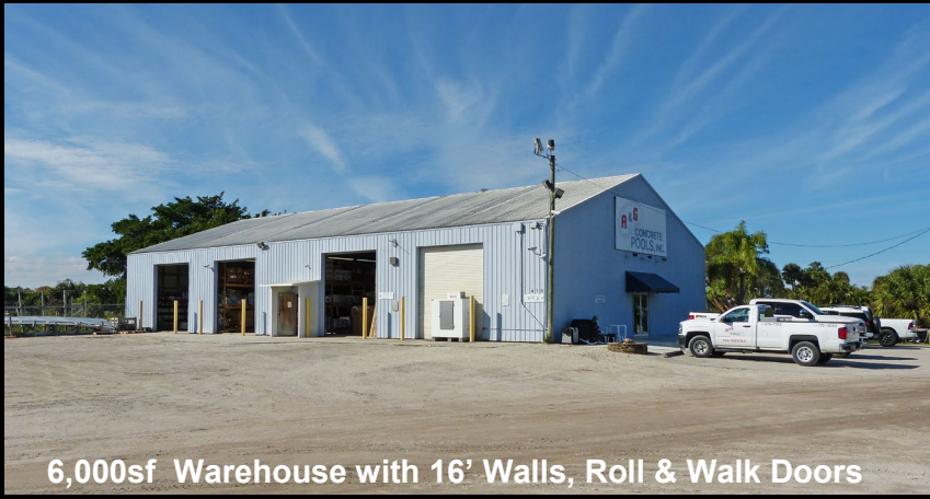
6,000sf Warehouse with 16' Walls, Roll & Walk Doors