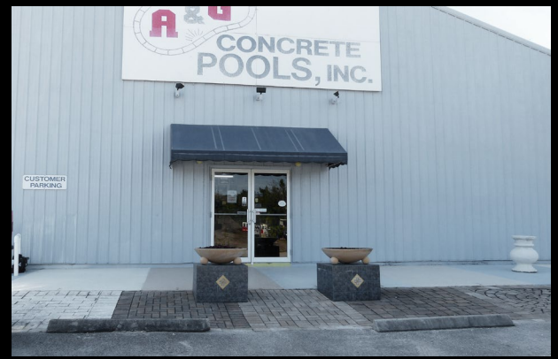
Showroom & Office Entrance