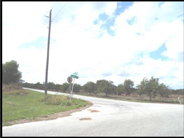
Southwest corner of grove intersection Doc Lind-