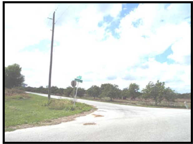
NE corner Murray and Gabriel Road.

This little grove is located about 2,000 ft. South of the Polk County boat landing on Doc Lindsey Road. This location of the grove South of the lake should typically provide some cold protection.