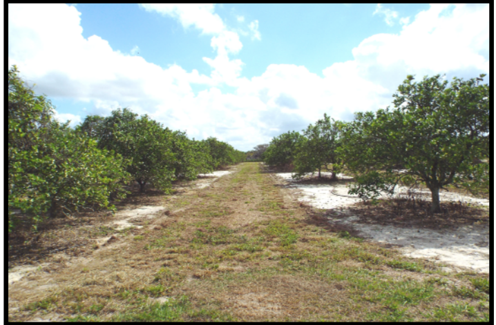
Grove area along Gabriel Road.