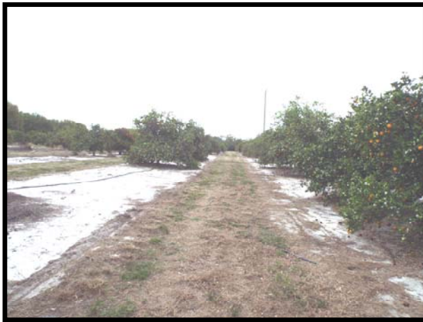
East side is Valencia. Lots of "skips" .