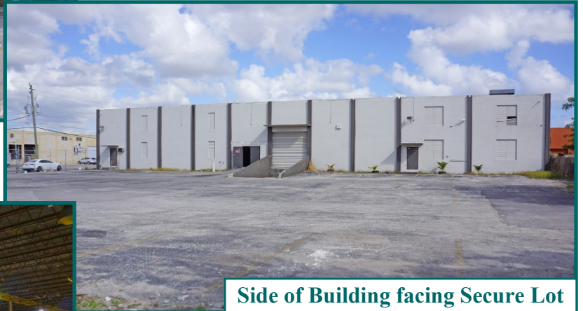
Side of Building facing Secure Lot