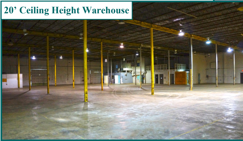
20' Ceiling Height Warehouse