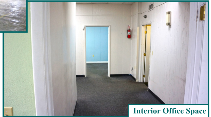
Interior Office Space