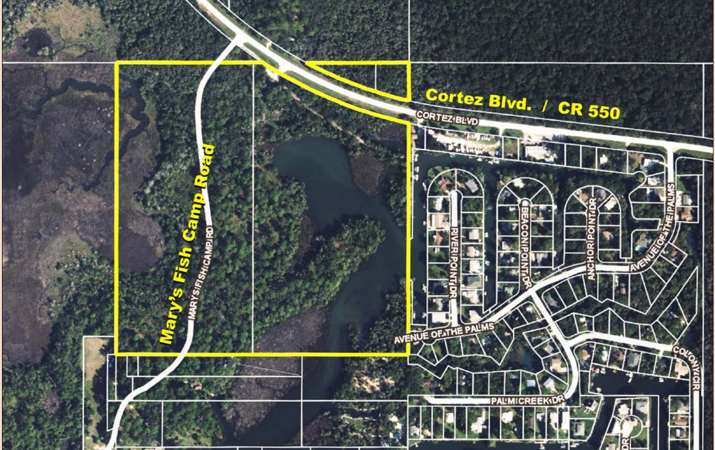
Concept Site Plan