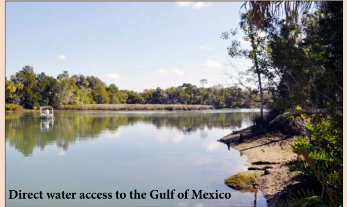
Direct water access to the Gulf of Mexico

Uses: Residential development, recreational acreage, estate acreage homesite, RV park