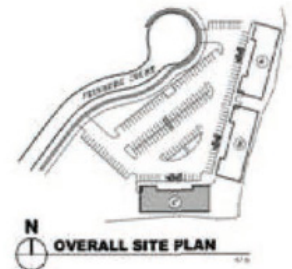
OVERALL SITE PLAN