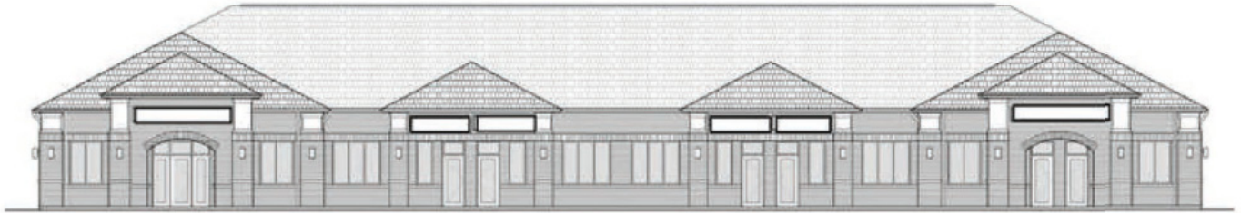
FRONT ELEVATION BUILDING C

Cary Square Professional Center 835 Feinberg Court Cary, IL 60013