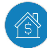
AVG. HOUSEHOLD INCOME