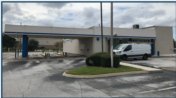
DRIVE THRU LANES