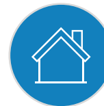
NUMBER OF HOUSEHOLDS