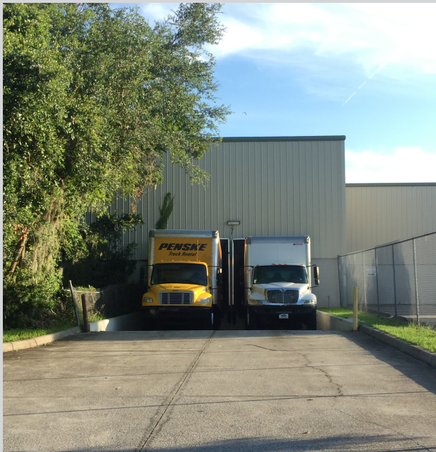
Dock High Loading Area