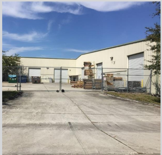
Fenced Parking + Storage Area