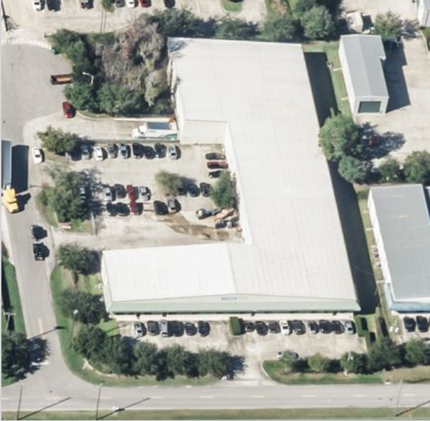
Aerial View looking West