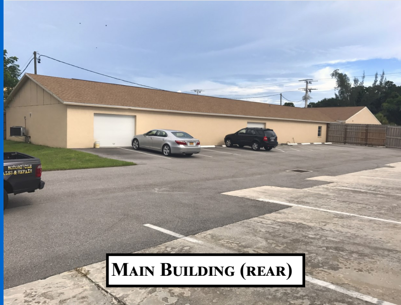
MAIN BUILDING (REAR)