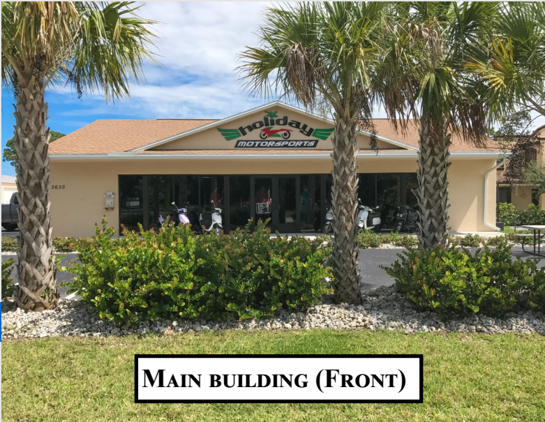
MAIN BUILDING (FRONT)