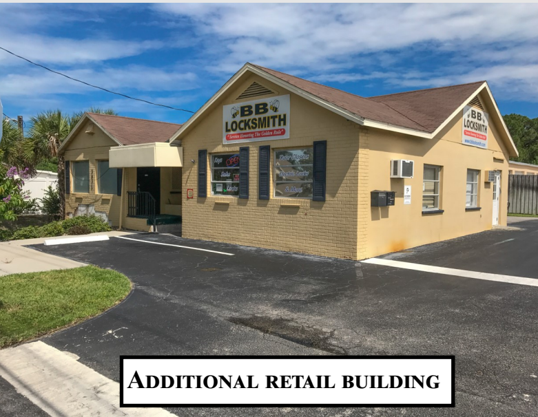
ADDITIONAL RETAIL BUILDING