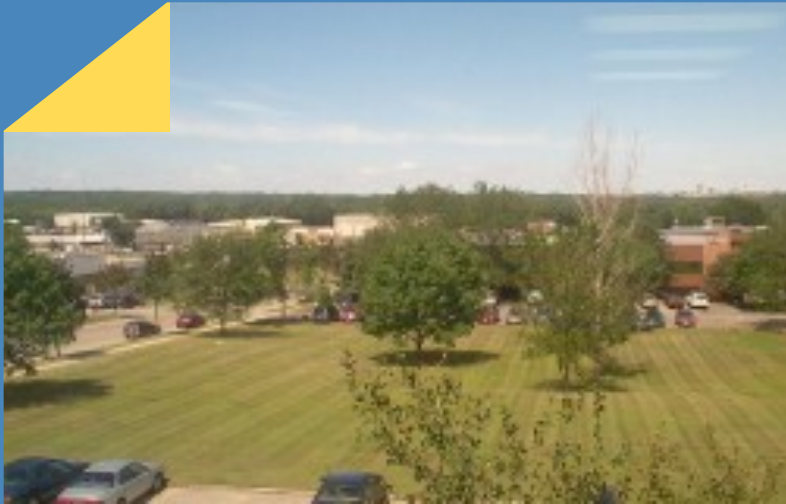
Office/Residential Development Site