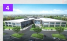
4 Edison at Primera Primera Blvd