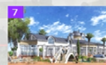
7 Griffin Farms Longwood Lake Mary