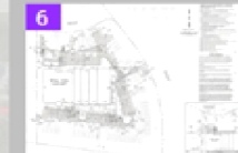
6 Epic Lake Mary 901 Currency Circle