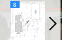
8 EDC Parking Lot E 755 Rinehart