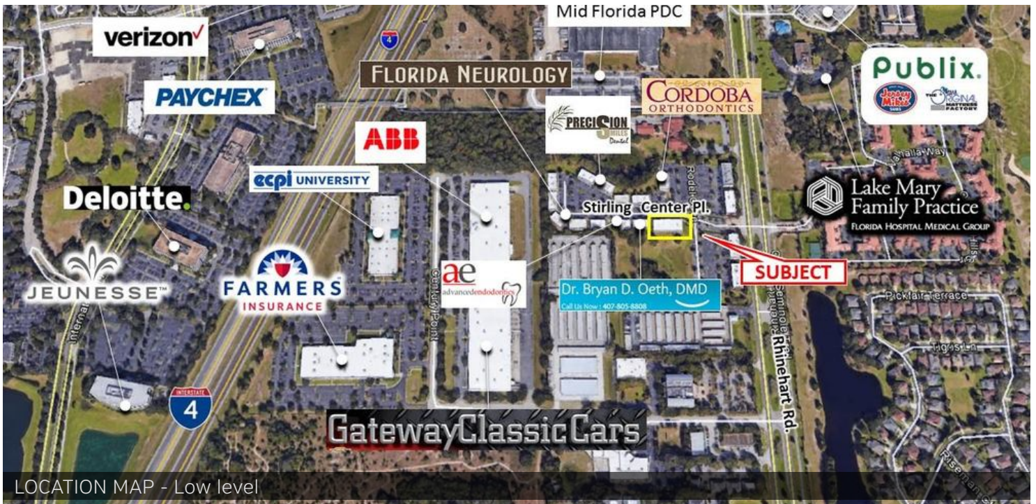
LOCATION MAP - Low level