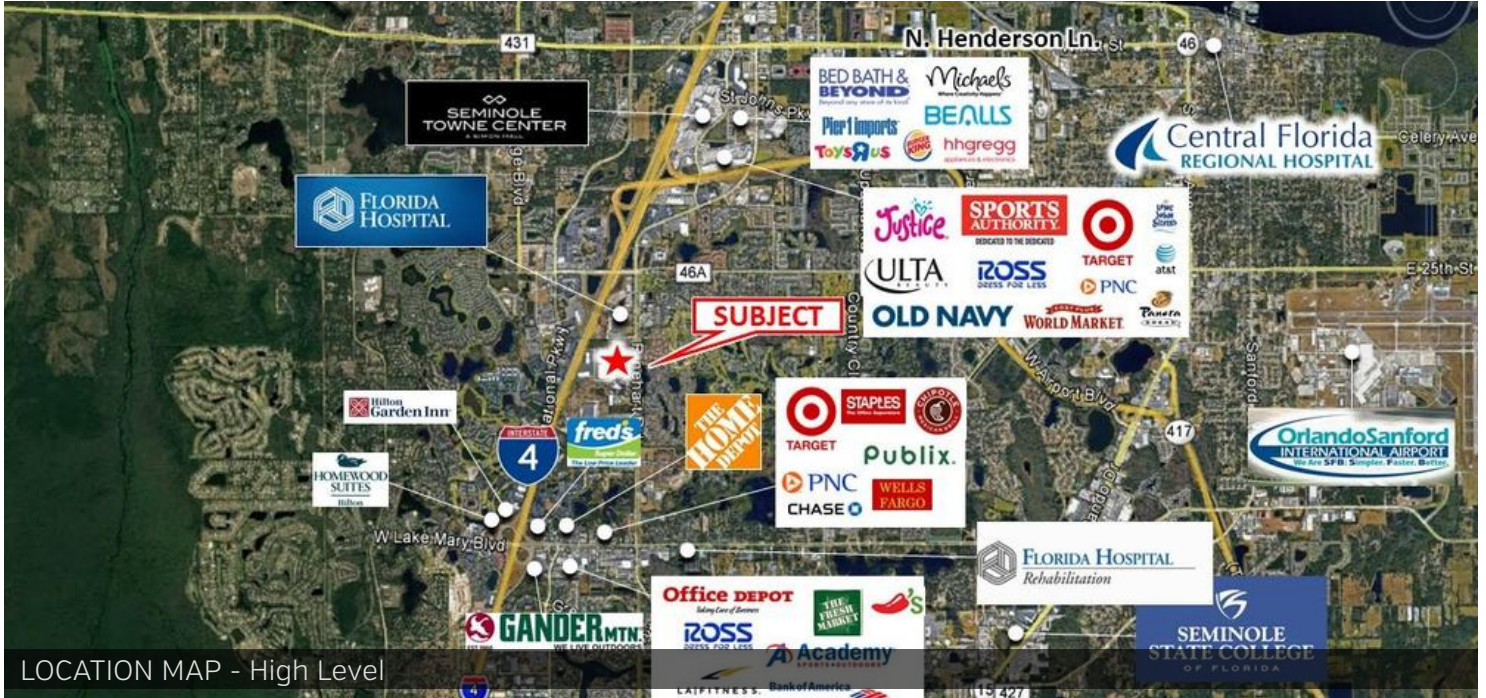
LOCATION MAP - High Level

731 Stirling Center Place, Lake Mary, FL 32746