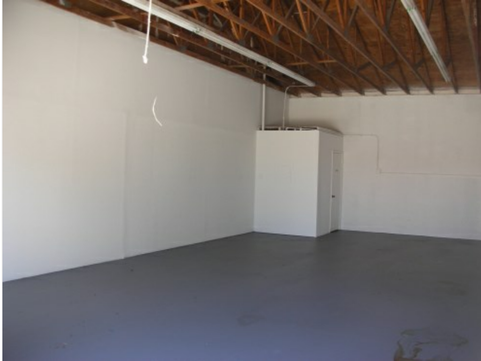
800 SF with Small Reception/Office