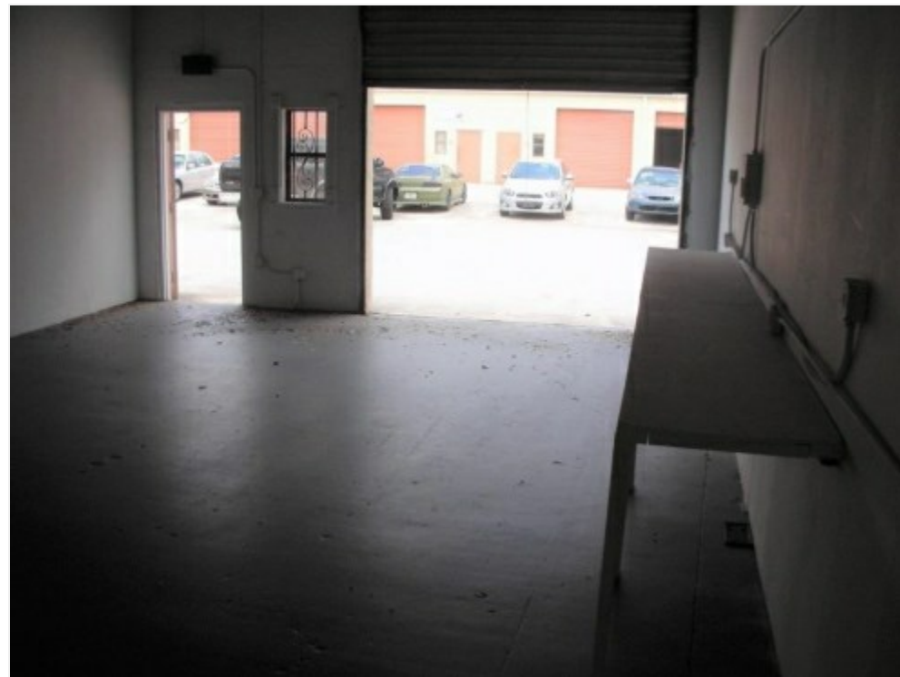
800 SF with Work Stations & Back Office ref 1282C