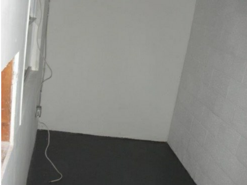
800 SF with Work Stations & Back Office ref 1282C