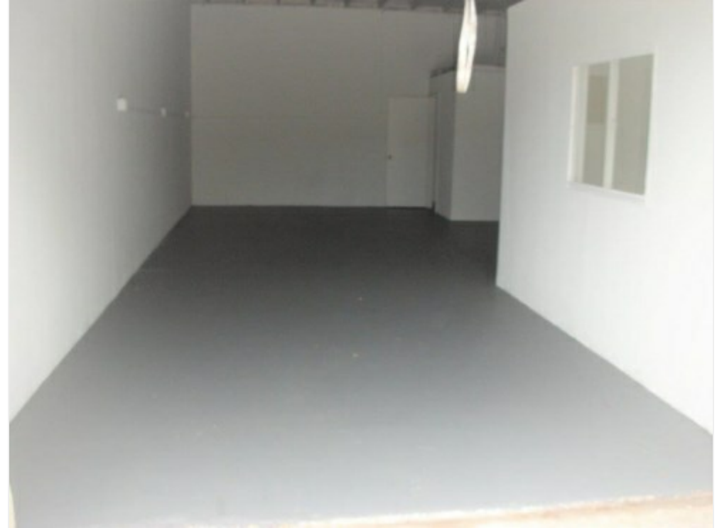
800 SF with Front Office/Recpt. ref 1290D