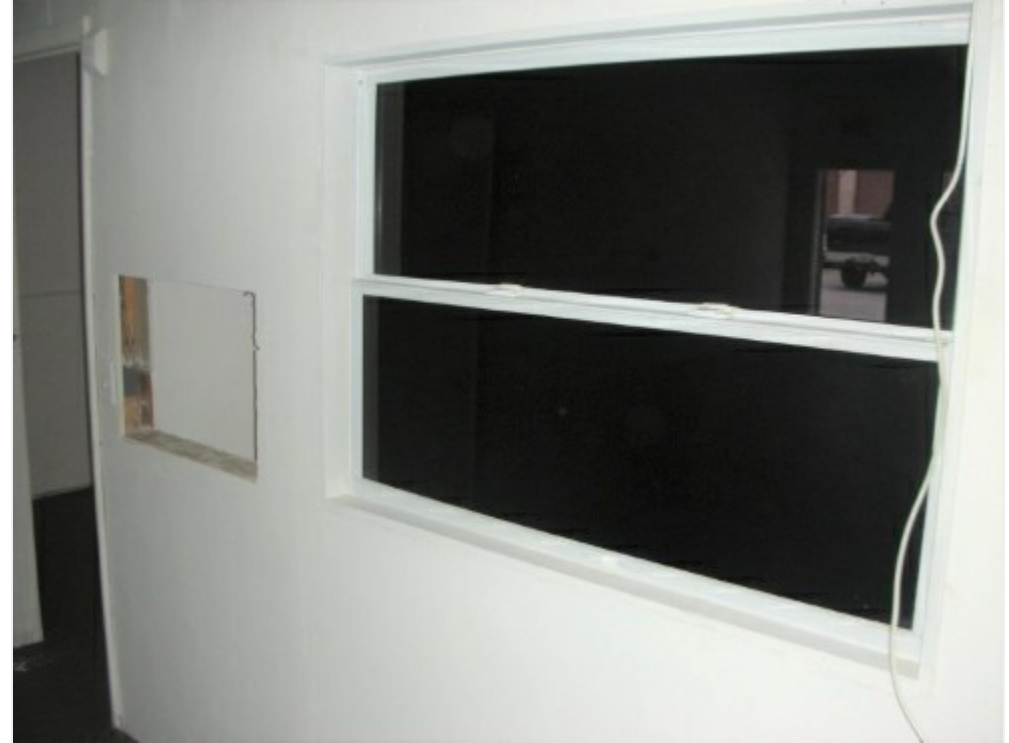
800 SF with Work Stations & Back Office ref 1282C