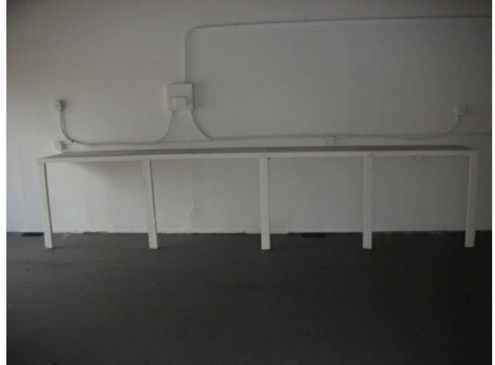
800 SF with Work Stations & Back Office ref 1282C