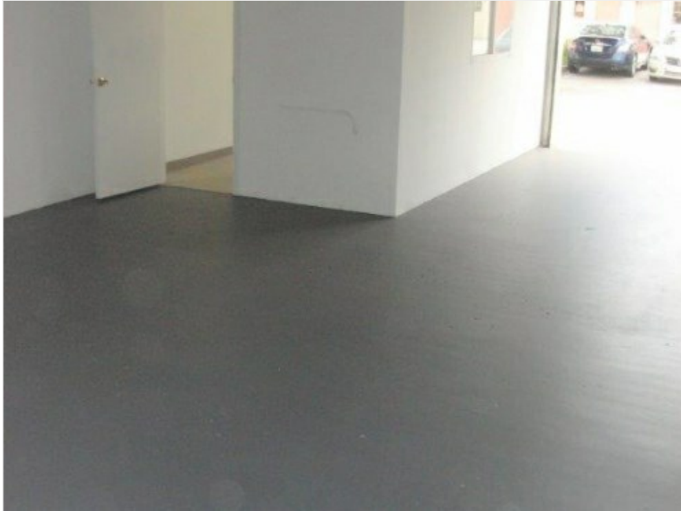
800 SF with Front Office/Recpt. ref 1290D