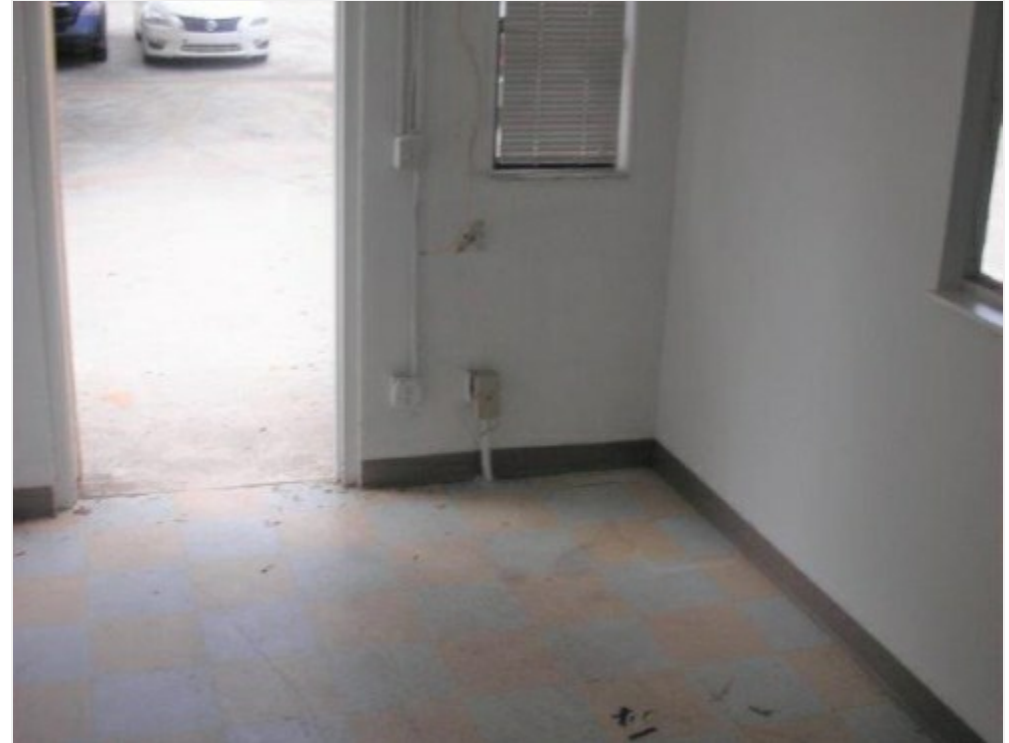
800 SF with Front Office/Recpt. ref 1290D