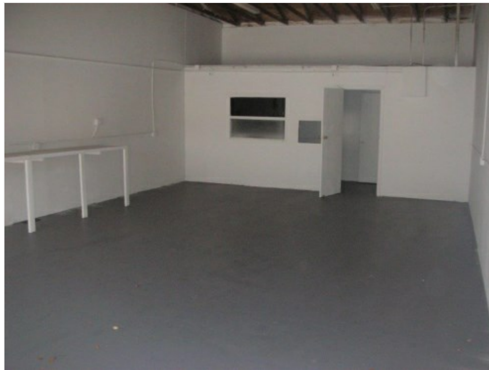
800 SF with Work Stations & Back Office ref 1282C