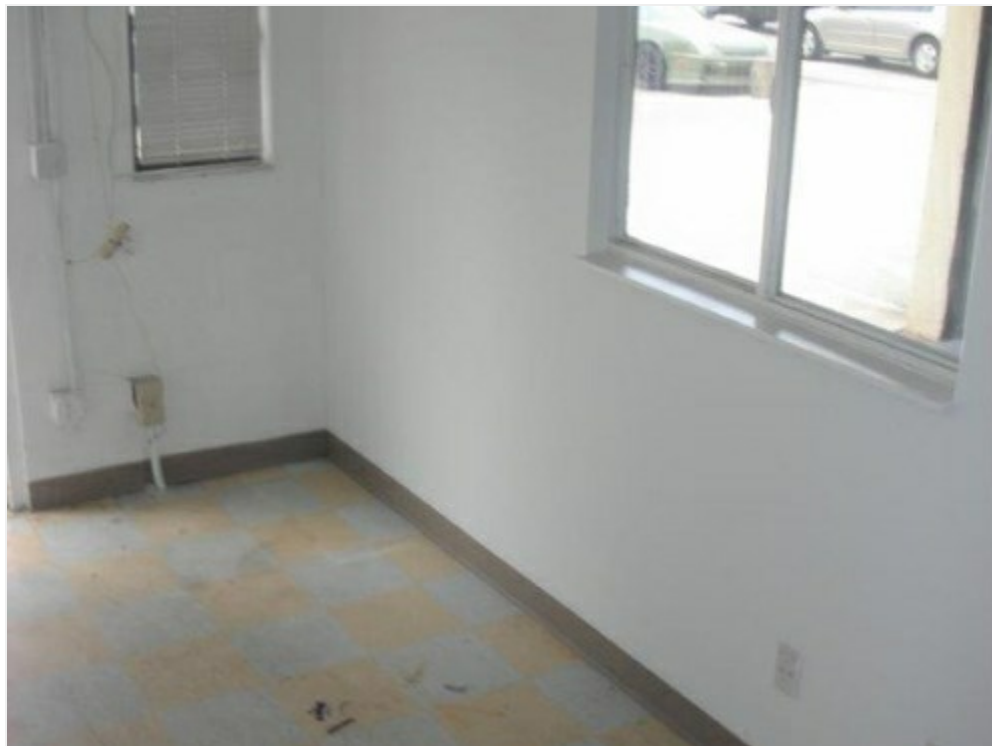
800 SF with Front Office/Recpt. ref 1290D