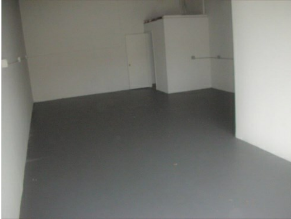
800 SF with Front Office/Recpt. ref 1290D