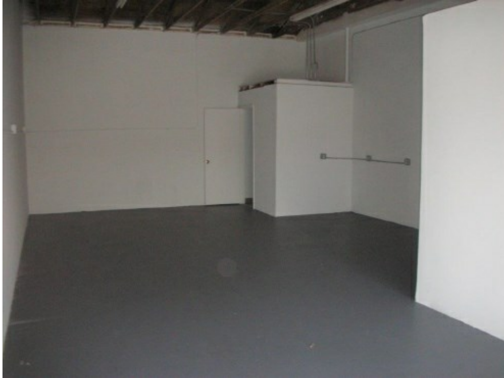
800 SF with Front Office/Recpt. ref 1290D