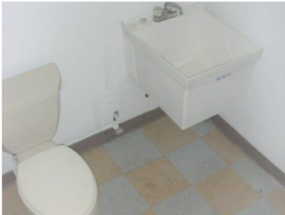
800 SF with Front Office/Recpt. ref 1290D