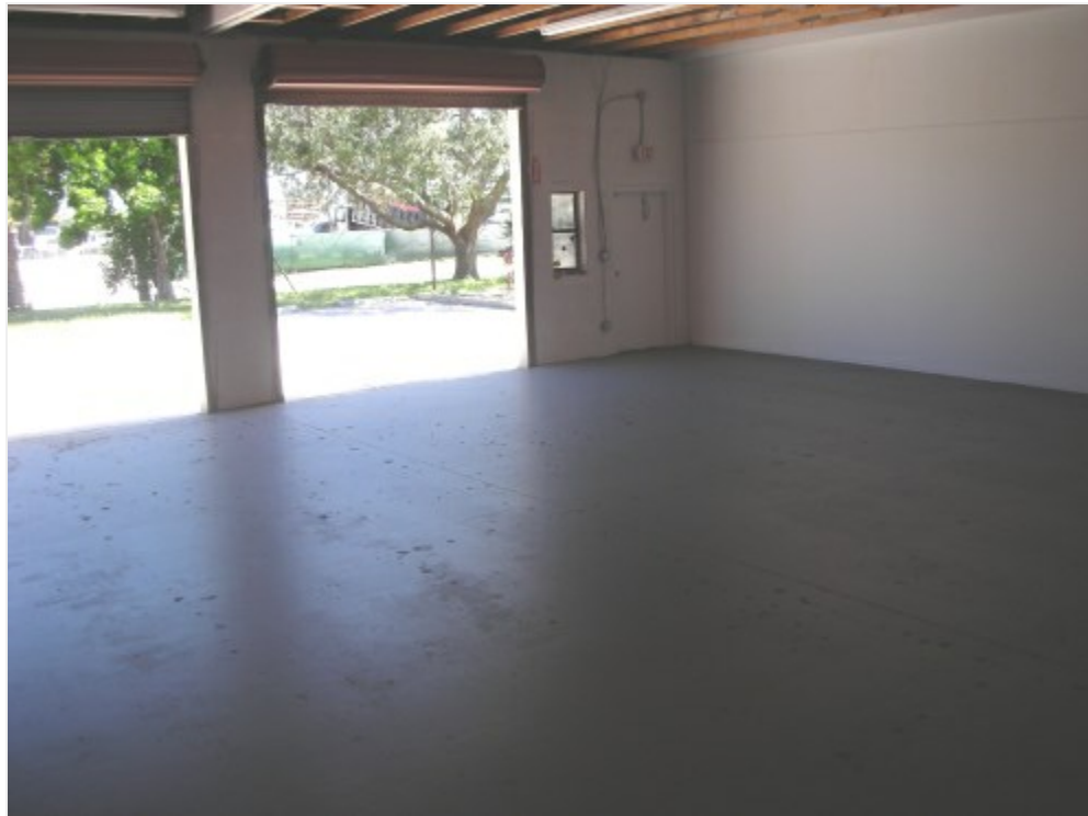
1600 SF Dbl Bay Doors ref 1298 C&D