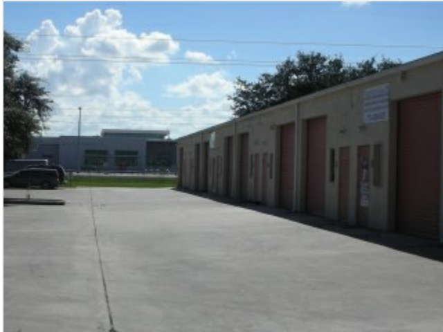
SW Biltmore Street Steps from Bayshore Blvd