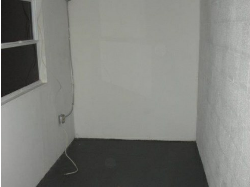
800 SF with Work Stations & Back Office ref 1282C