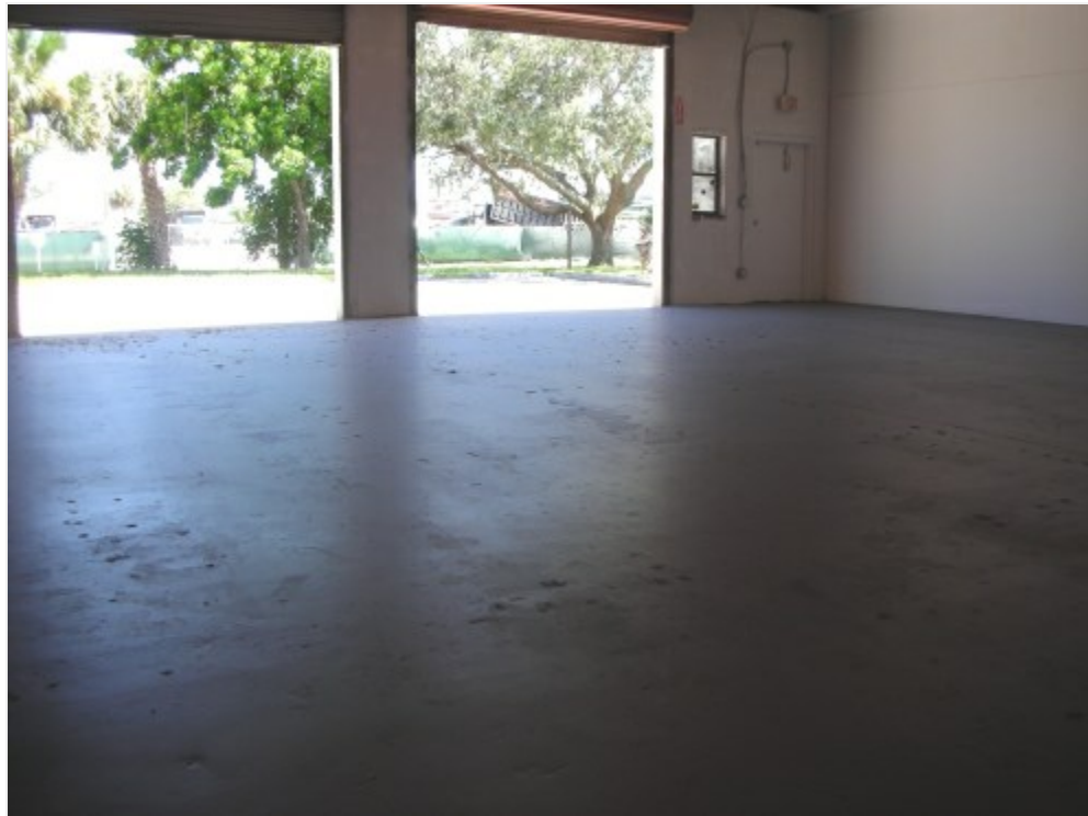
1600 SF Dbl Bay Doors ref 1298 C&D