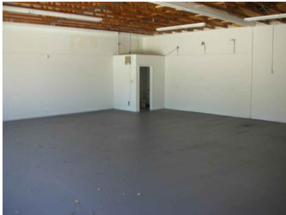
1600 SF Dbl Bay Doors ref 1298 C&D