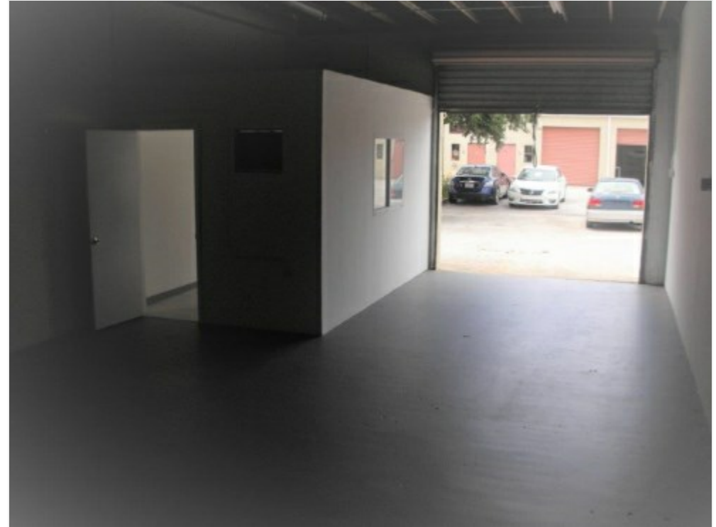
800 SF with Front Office/Recpt. ref 1290D