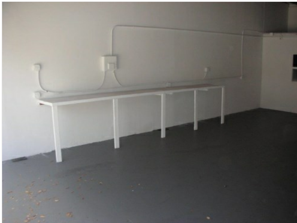
800 SF with Work Stations & Back Office ref 1282C