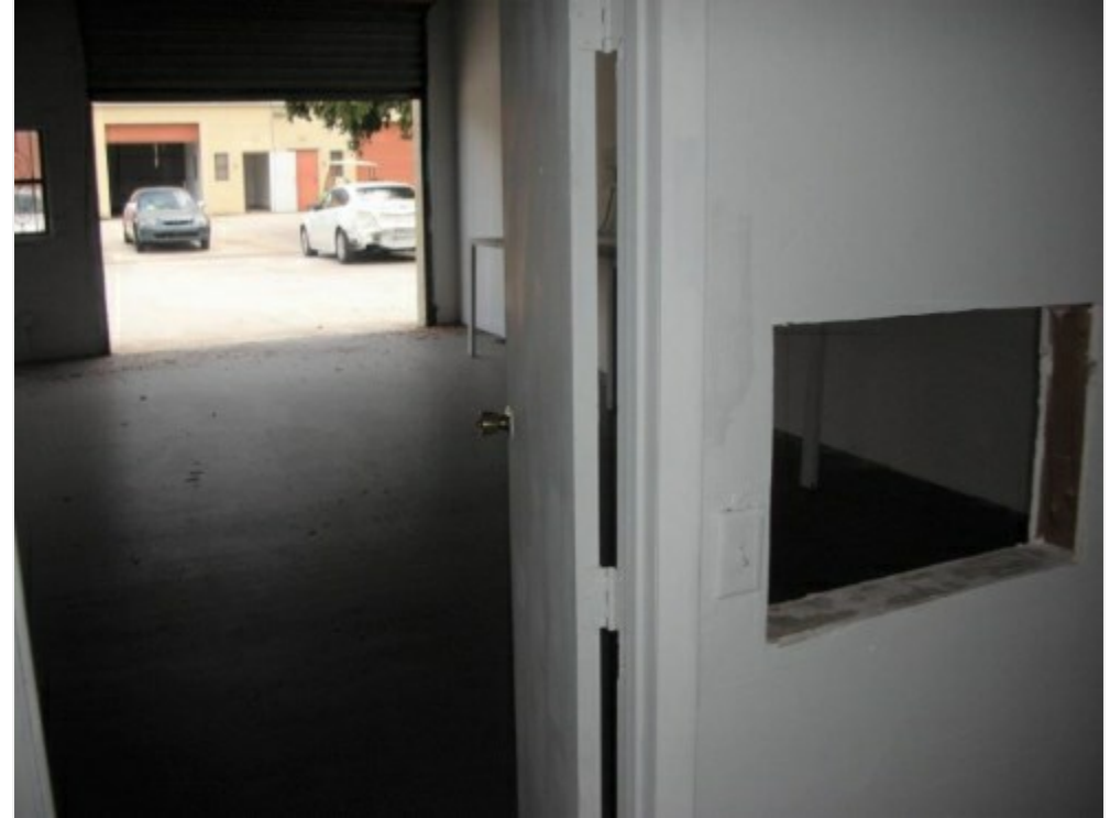
800 SF with Work Stations & Back Office ref 1282C