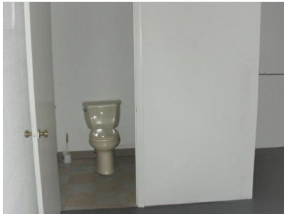
800 SF with Front Office/Recpt. ref 1290D