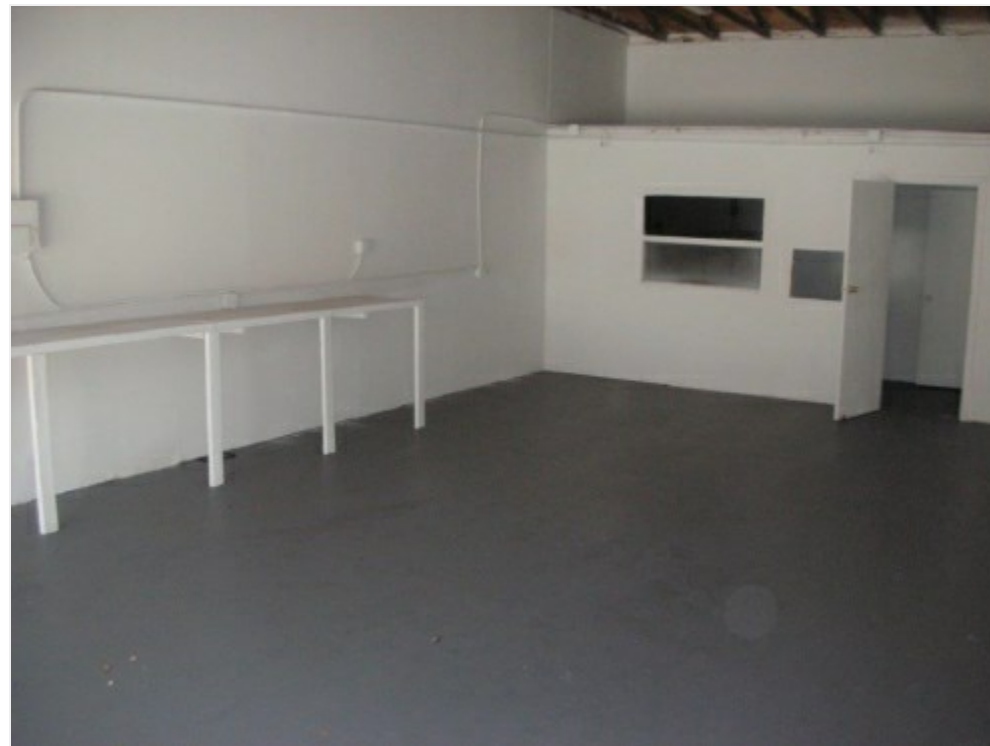
800 SF with Work Stations & Back Office ref 1282C