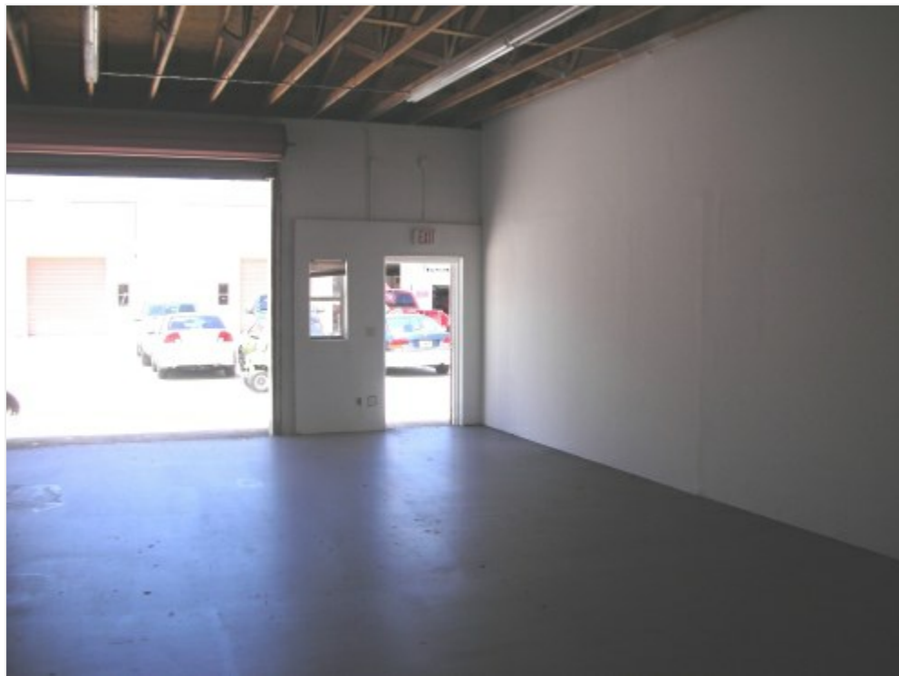
800 SF with Small Reception/Office