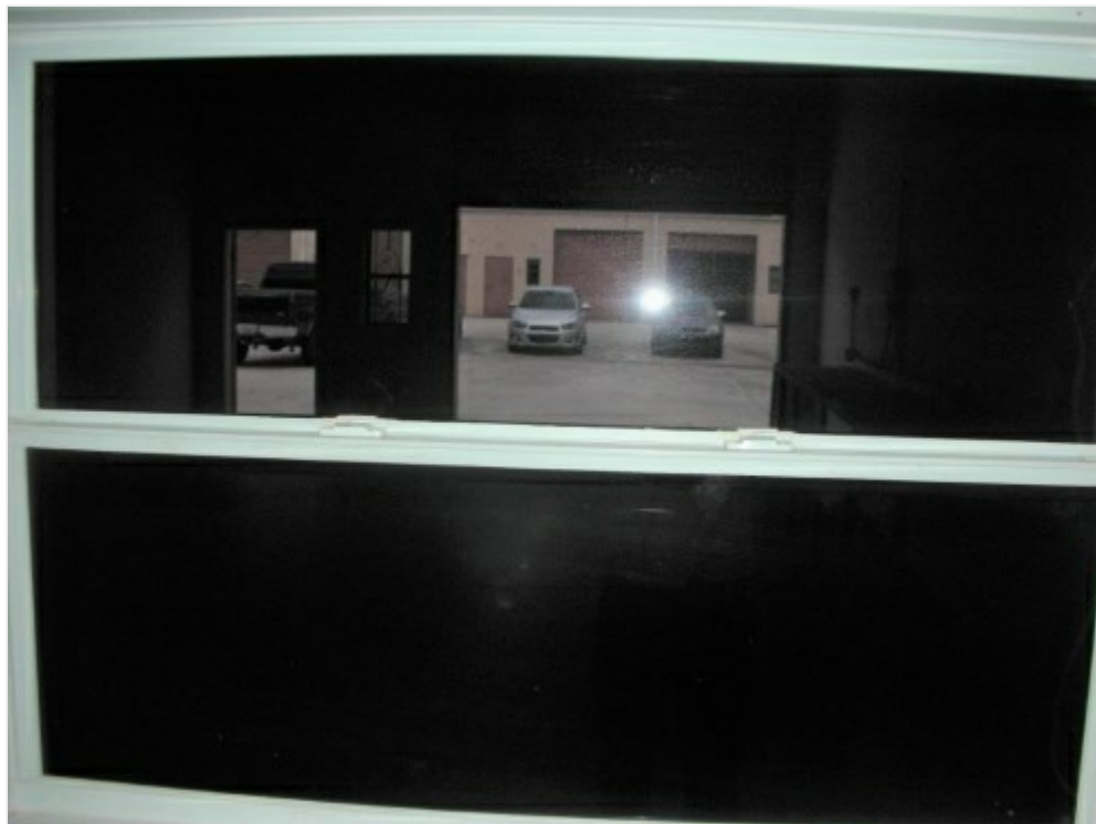
800 SF with Work Stations & Back Office ref 1282C