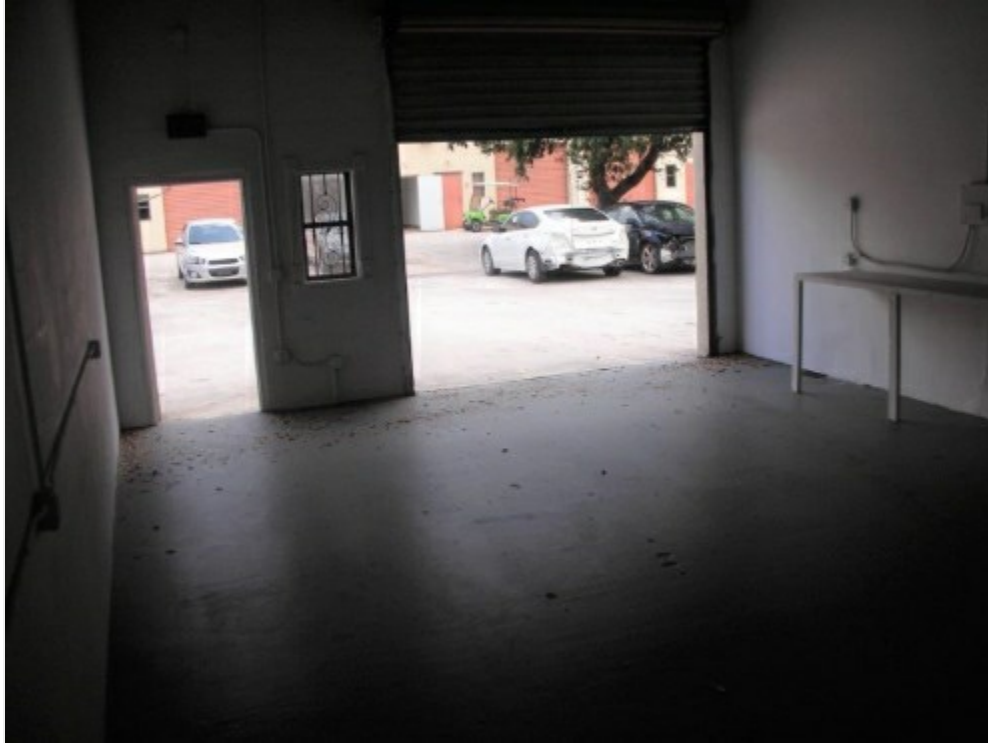
800 SF with Work Stations & Back Office ref 1282C