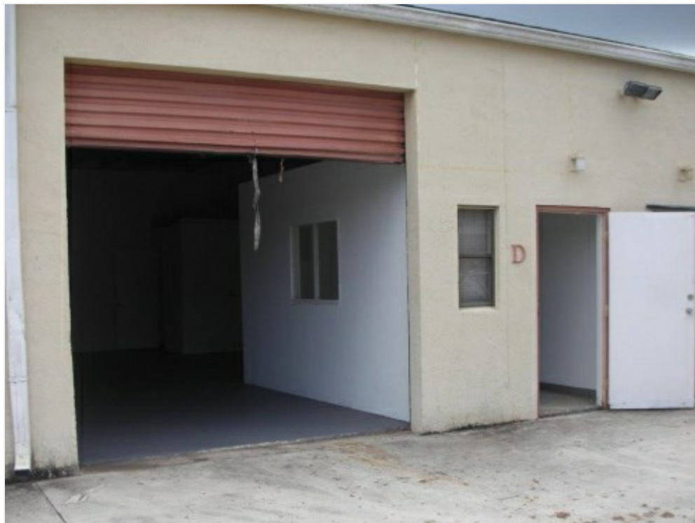
800 SF with Front Office/Recpt. ref 1290D