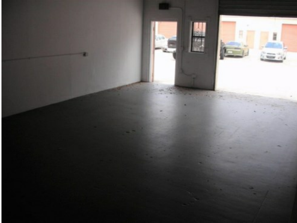
800 SF with Work Stations & Back Office ref 1282C