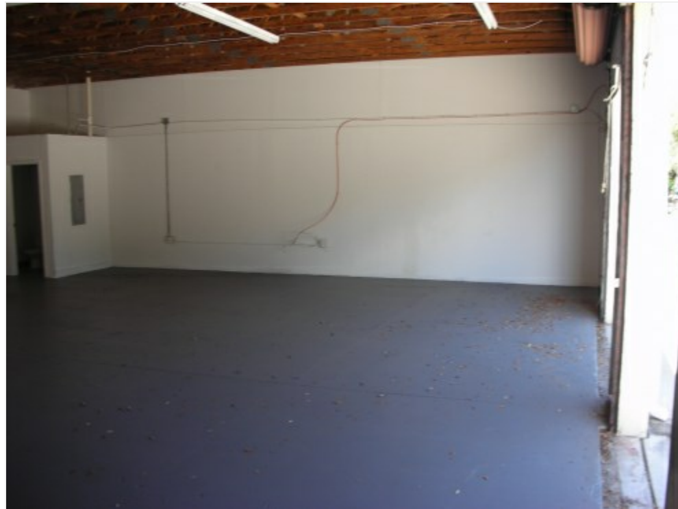
1600 SF Dbl Bay Doors ref 1298 C&D