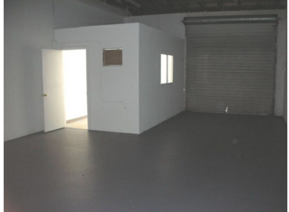
800 SF with Small Reception/Office