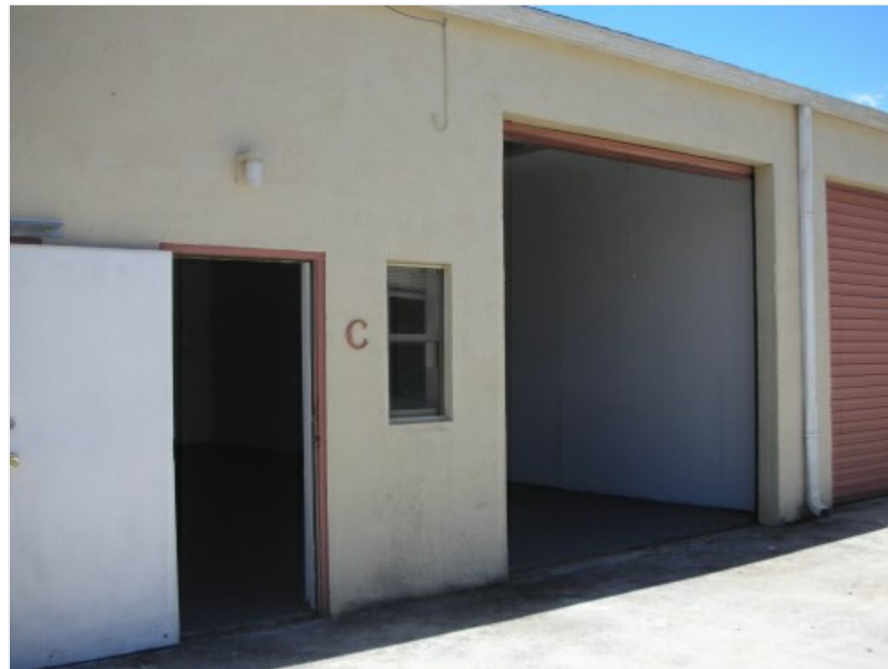
800 SF with Small Reception/Office