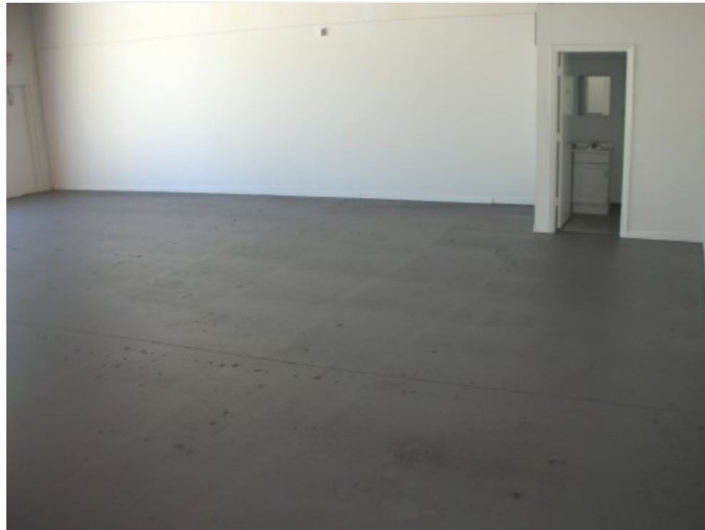
1600 SF Dbl Bay Doors ref 1298 C&D