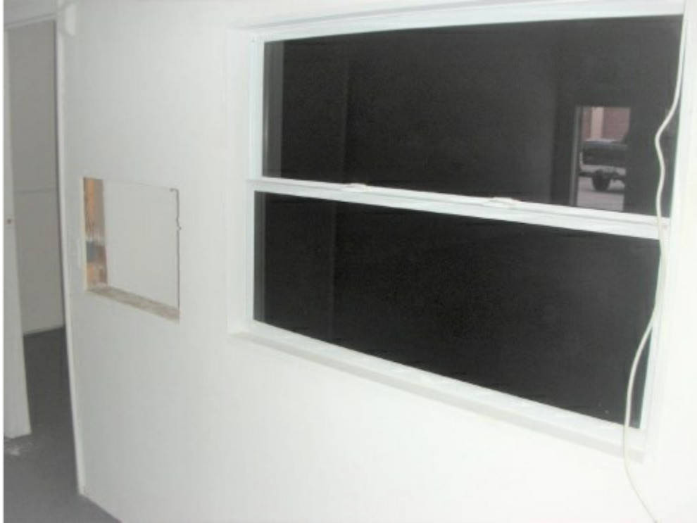
800 SF with Work Stations & Back Office ref 1282C