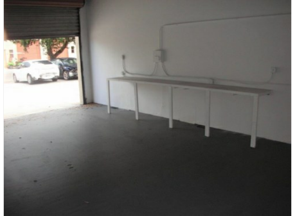
800 SF with Work Stations & Back Office ref 1282C