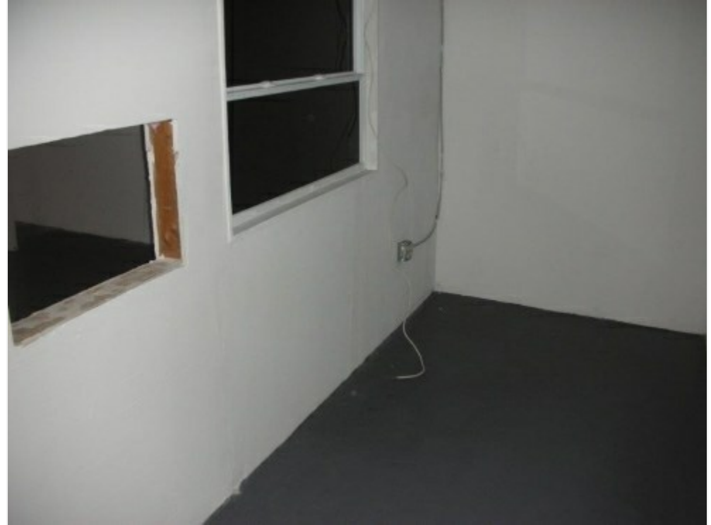
800 SF with Work Stations & Back Office ref 1282C