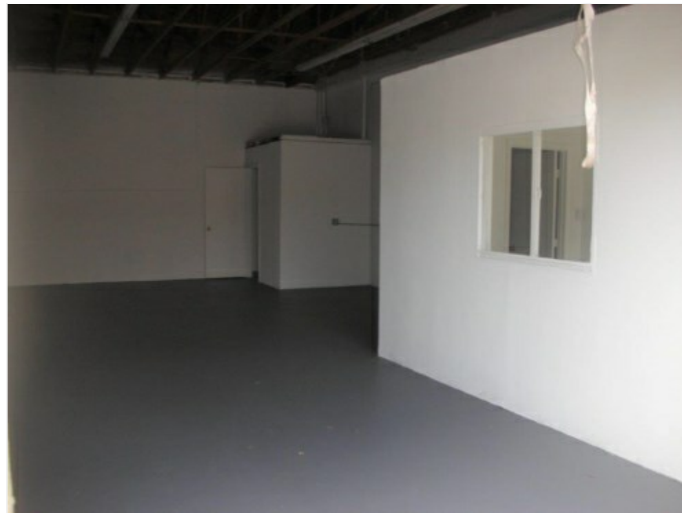
800 SF with Front Office/Recpt. ref 1290D