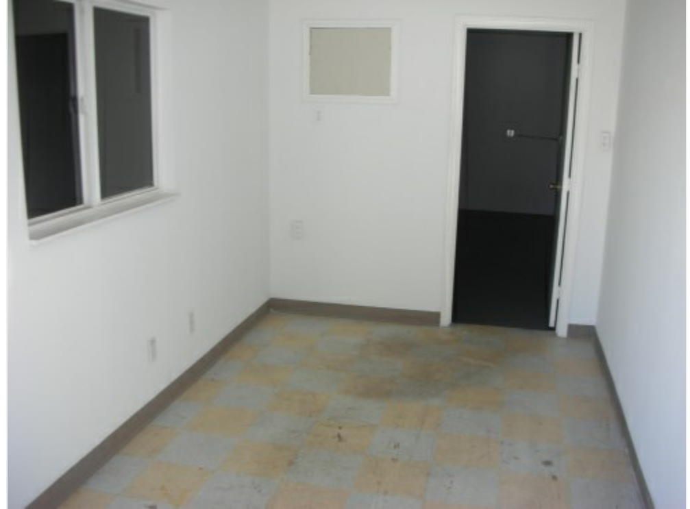
800 SF with Small Reception/Office