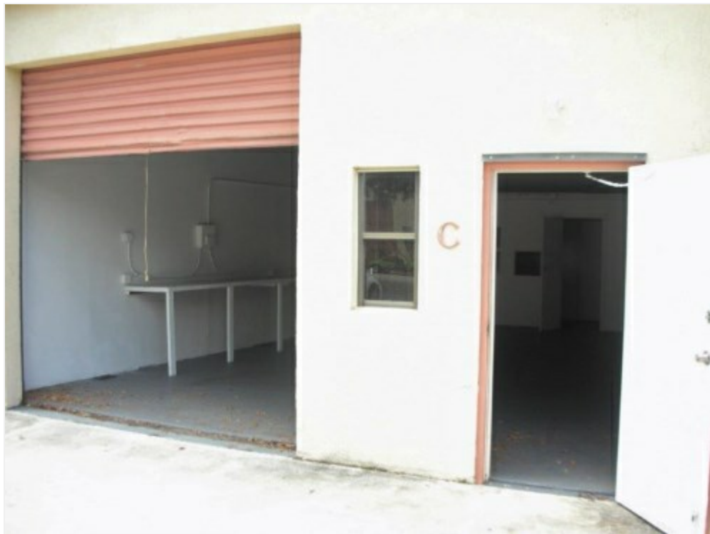
800 SF with Work Stations & Back Office ref 1282C