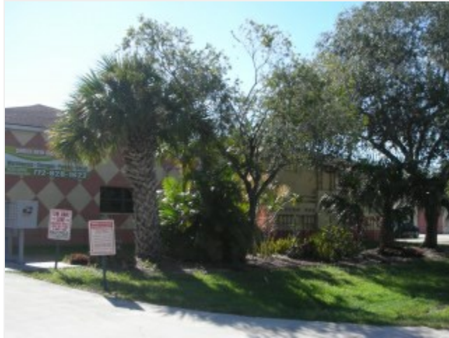
SW Biltmore Street Steps from Bayshore Blvd

1298 SW Biltmore Street, Port Saint Lucie, FL 34983