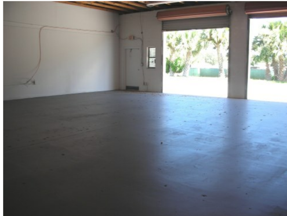
1600 SF Dbl Bay Doors ref 1298 C&D