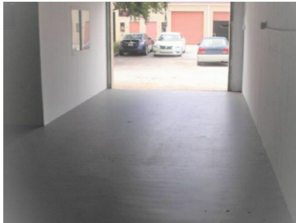
800 SF with Front Office/Recpt. ref 1290D