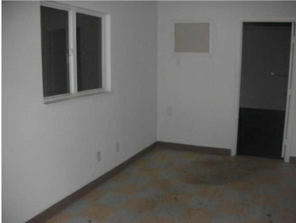
800 SF with Front Office/Recpt. ref 1290D