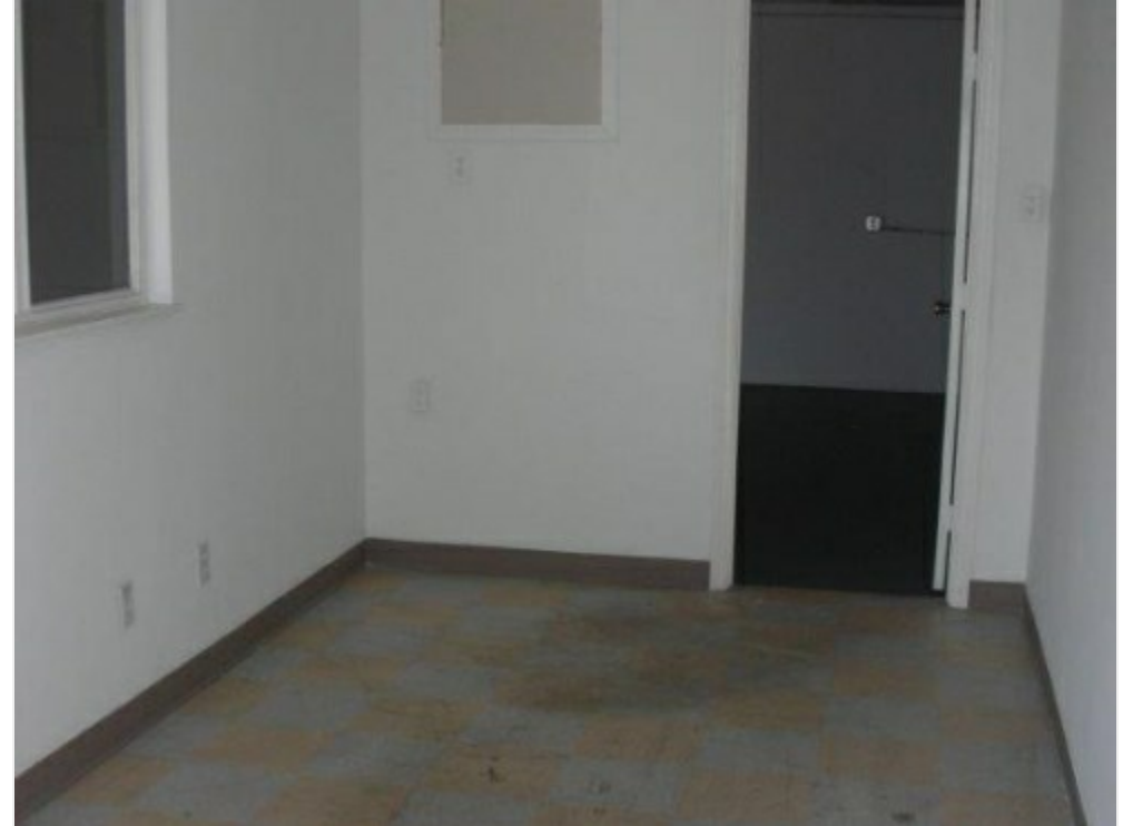
800 SF with Front Office/Recpt. ref 1290D