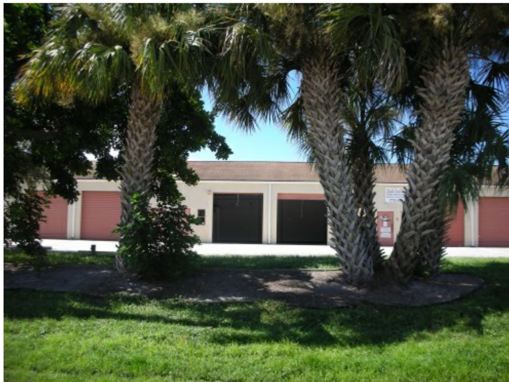
1600 SF Dbl Bay Doors ref 1298 C&D