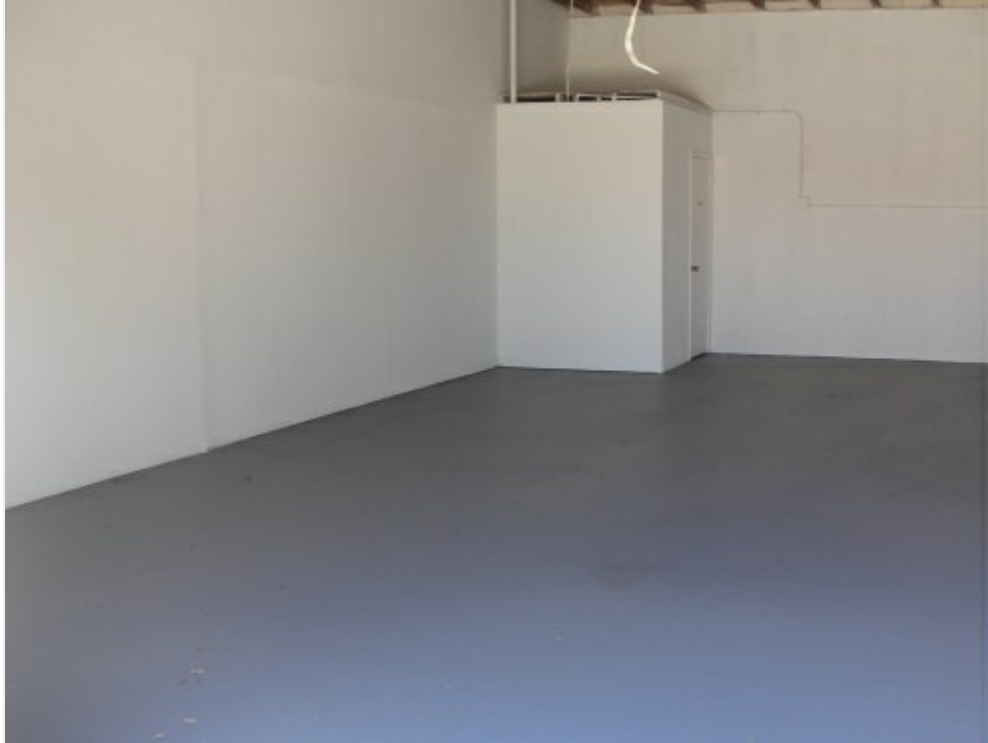
800 SF with Small Reception/Office