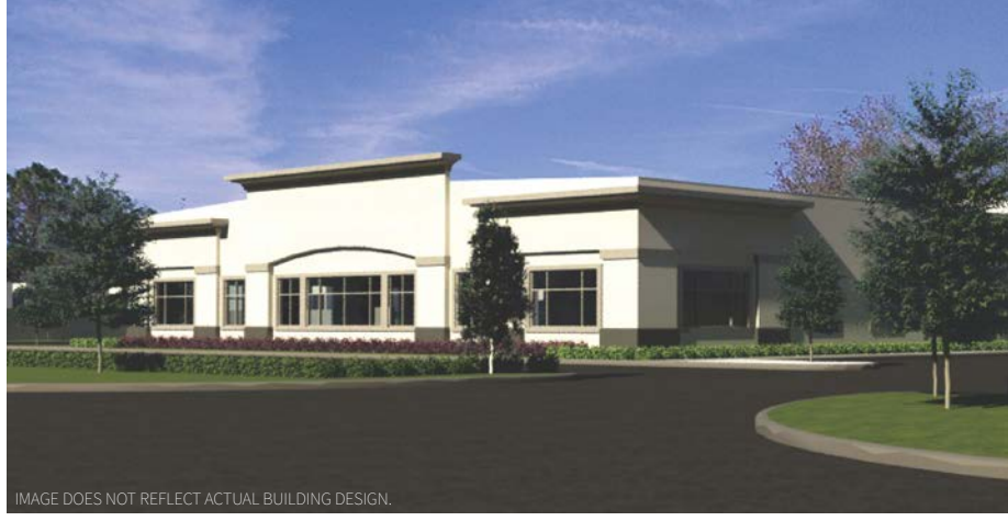
IMAGE DOES NOT REFLECT ACTUAL BUILDING DESIGN.