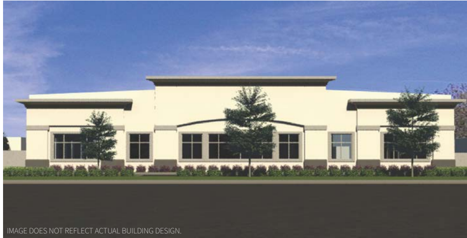
IMAGE DOES NOT REFLECT ACTUAL BUILDING DESIGN.