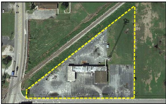
BELLE GLADE, FL - 1525 Dr. Martin Luther King Blvd 8,133 SF on 2.58 Acres

1525 Dr. Martin Luther King Jr. Blvd, Belle Glade, FL 33430