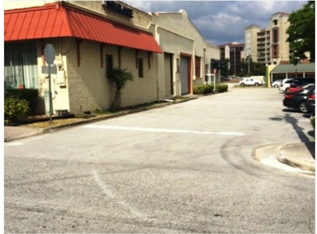
alley looking towards Highway 520