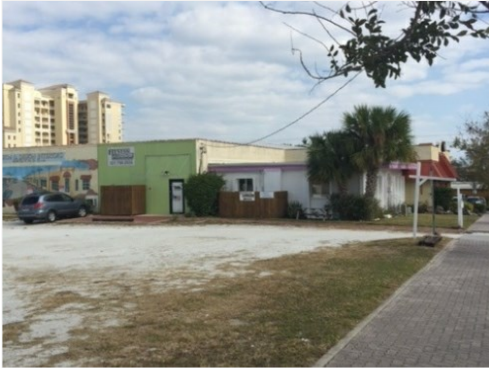
West side of building