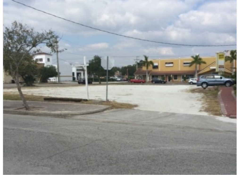
parking lot access from Oleander St