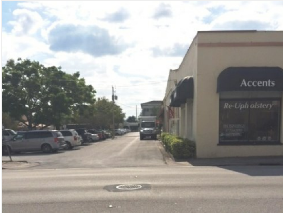
Alley and parking area