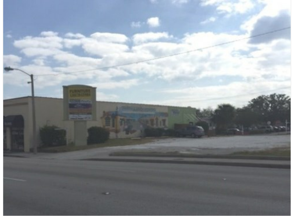
access to private parking lot