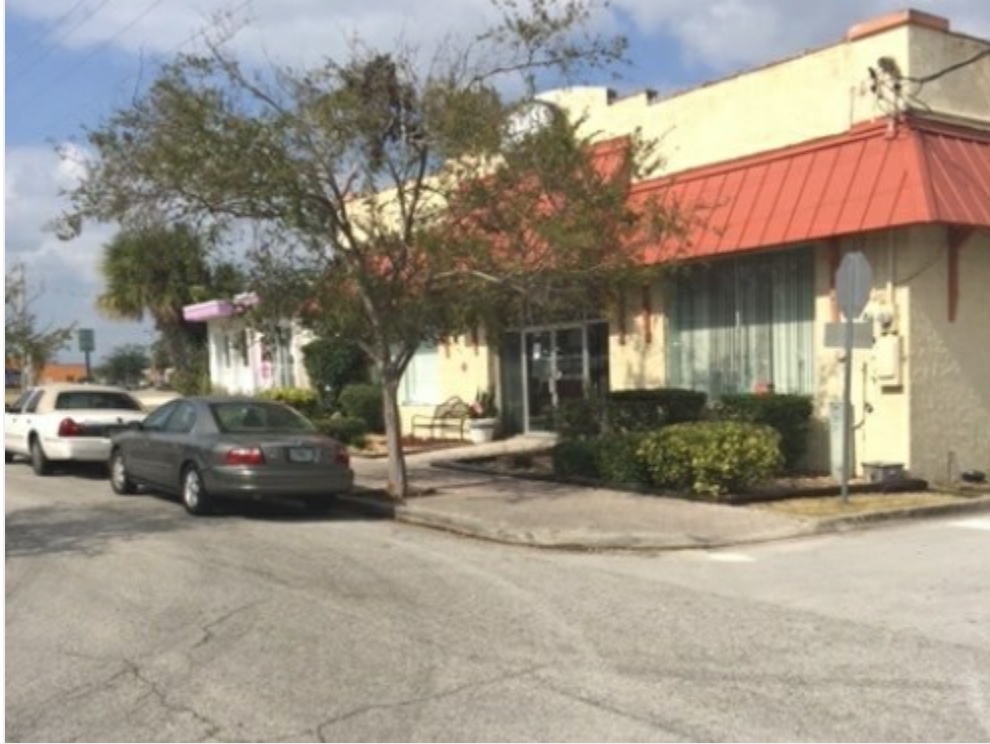
South East corner storefront