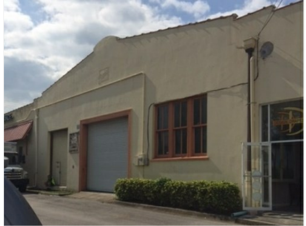
roll up doors