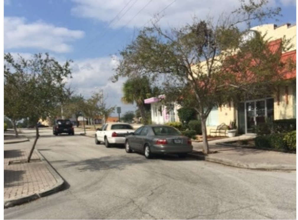
Oleander St has 2 storefronts