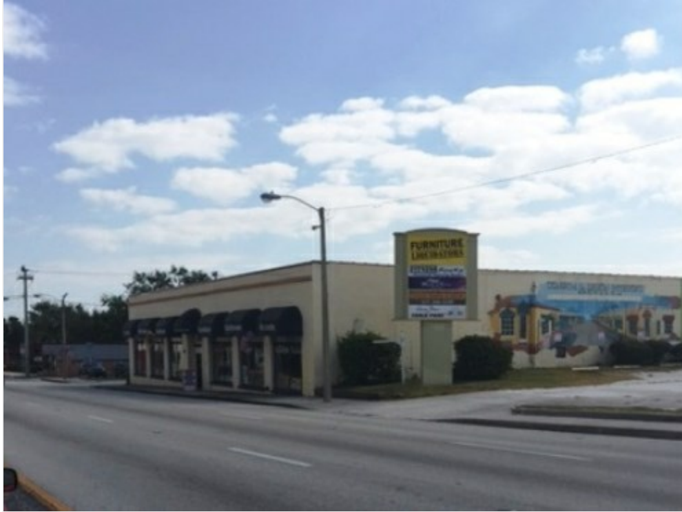
storefront on Highway 520 and parking lot access