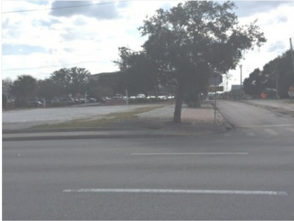
Corner of Forest Ave and Highway 520