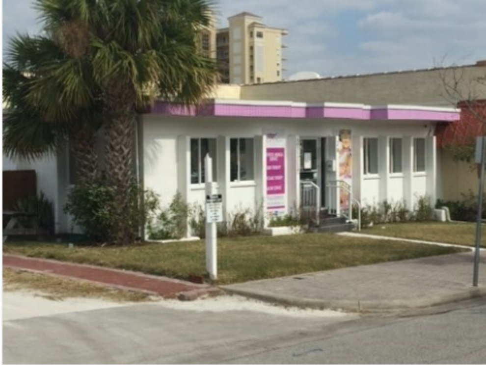
storefront SW corner