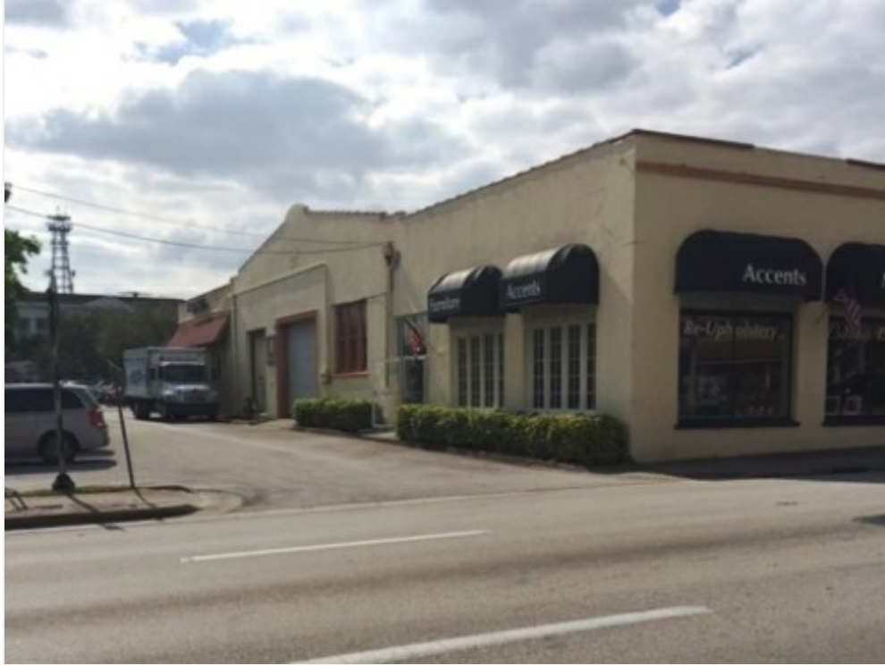
Alley access from Highway 520