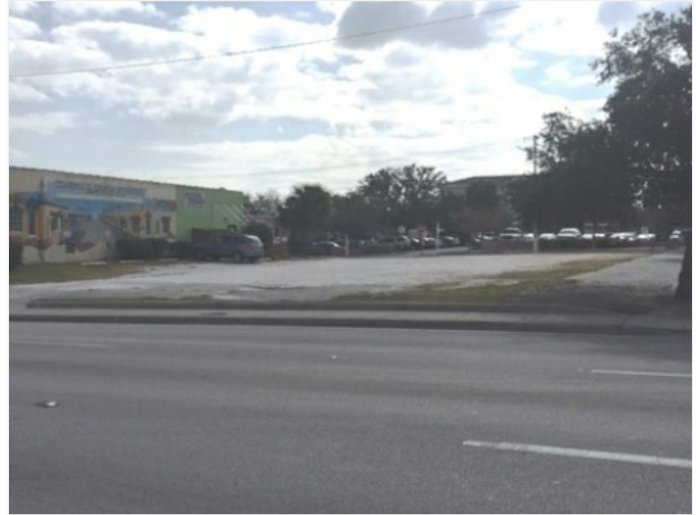
private parking lot