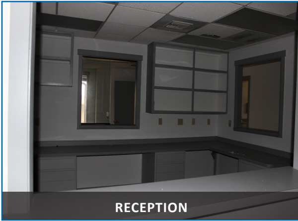
SUITE 401- 1,625 SF GENERAL PRACTICE SET-UP