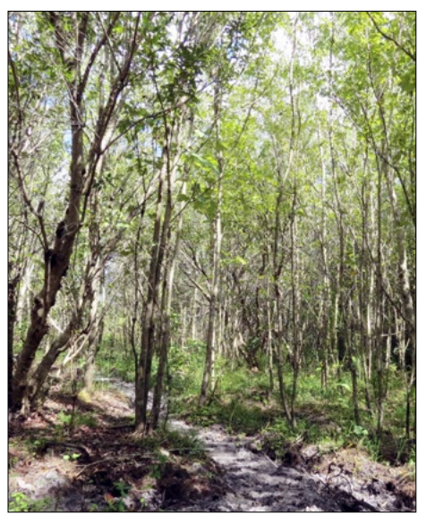
Beautiful Homesite with Acreage! Outdoor Recreation, Ag/Farming South Fork of the Little Manatee River Meanders Through Property!