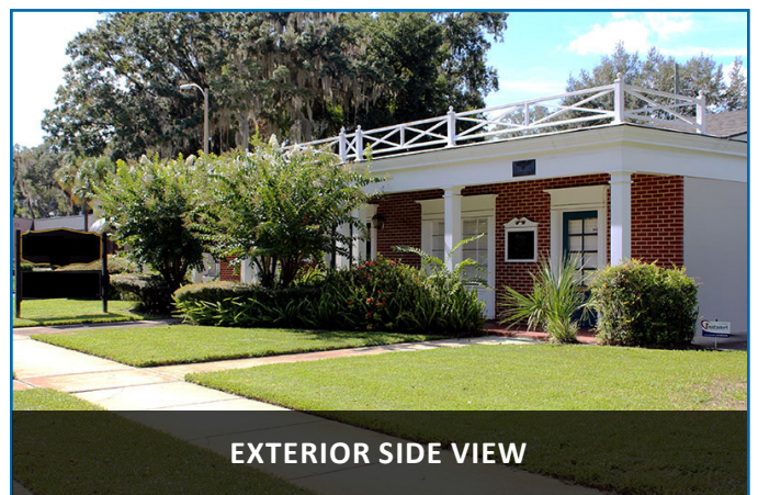
EXTERIOR SIDE VIEW