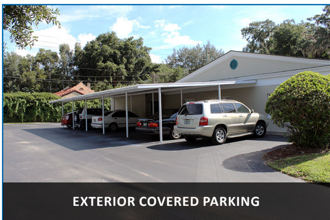
EXTERIOR COVERED PARKING