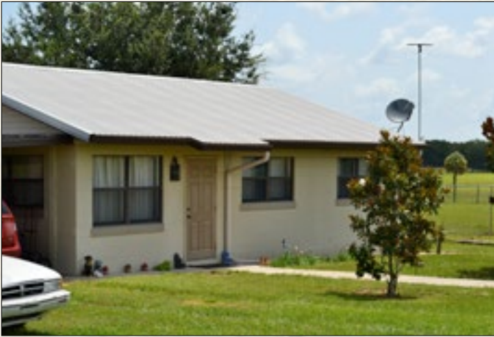
Manager's Home • 3 Bedrooms, 2 Full Baths 1,200 SF Total with 936 SF Living Space