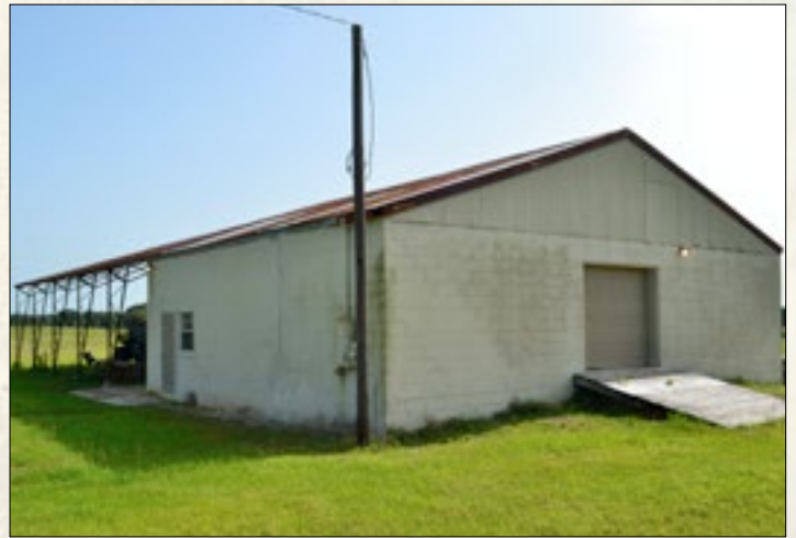
Partially Enclosed Barn • 3,840 SF Total 2,400 SF Open Pole Barn Area 1,440 SF Enclosed with a Full Bath